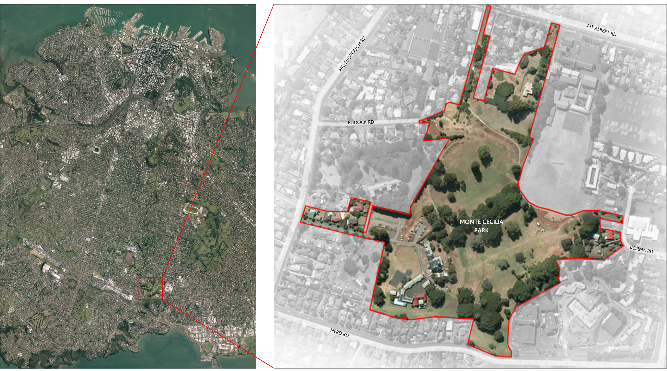
Figure 1. Auckland City