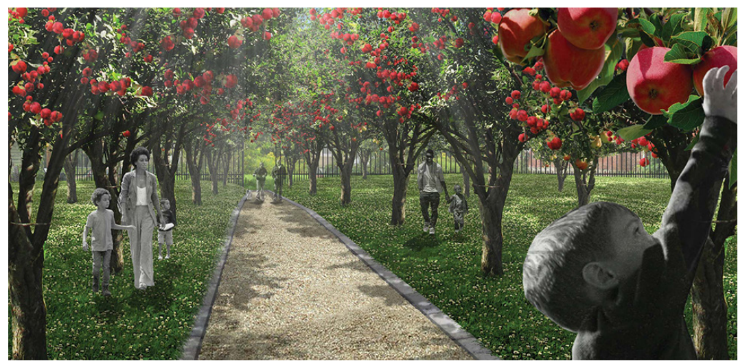
Figure 12. Orchards

Use native hedging for formal gardens adding native specimen trees and groves to support native flora (e.g. totara, puriri, kohekohe, tawa, karaka, taraire, kaikomako). Manage gardens to minimise weed habitat and hence weed growth and the need for herbicides.