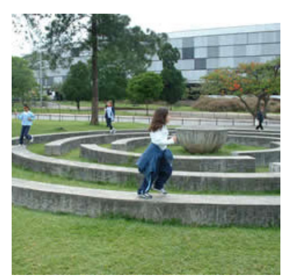
Figure 32. Bringing play into design