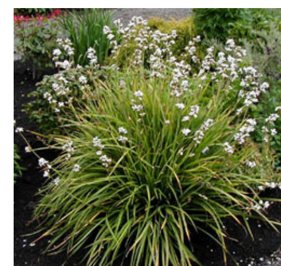
Figure 24. Libertia ixioides Mikoikoi