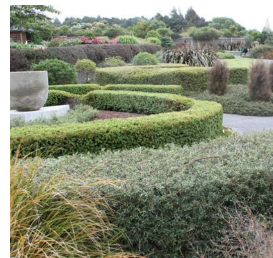
Figure 17. Native hedging - Botanical Gardgens