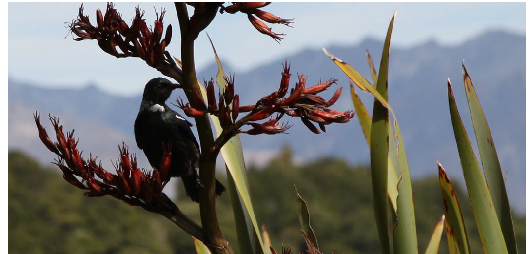
Figure 15. Tui in native planting