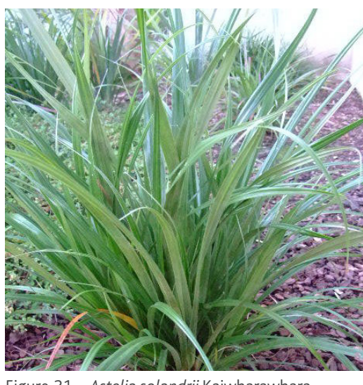
Figure 21. Astelia solandrii Kaiwharawhara