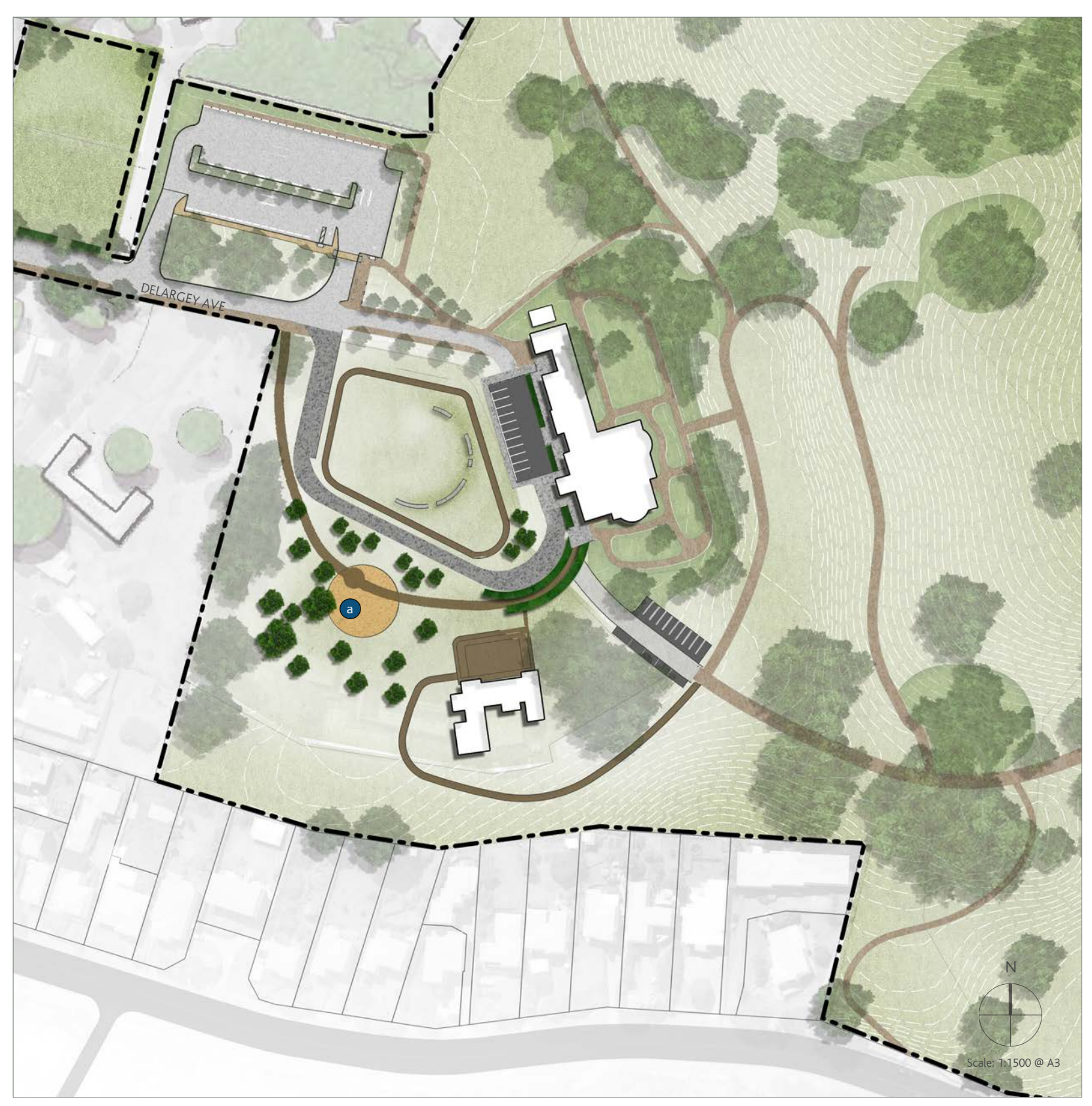
Figure 34. Playground location option 3