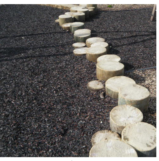
Figure 28. Interactive elements