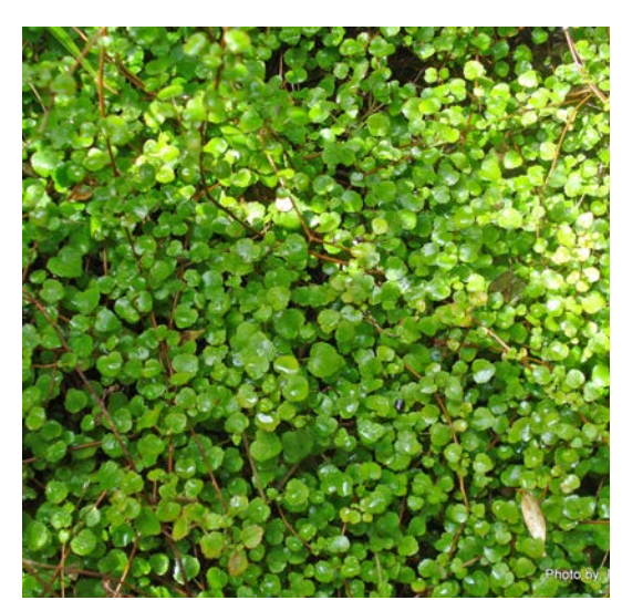
Figure 25. Fuchsia procumbens Tōtara