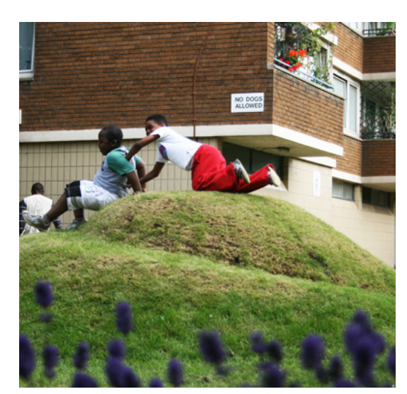
Figure 31. Landform contouring