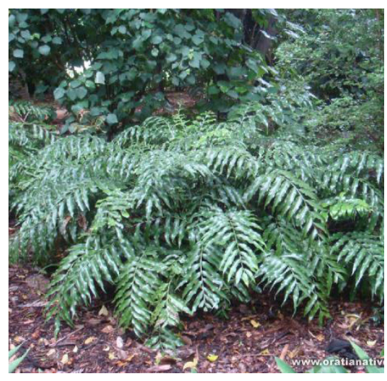
Figure 20. Asplenium oblongifolium Pānako