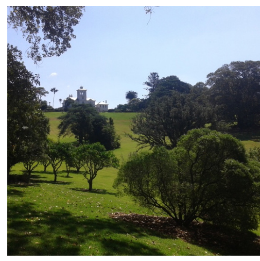
Figure 14. Feature tree groves - Monte Cecilia