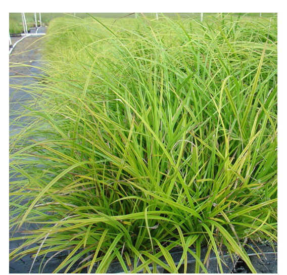
Figure 23. Carex dissita Purei