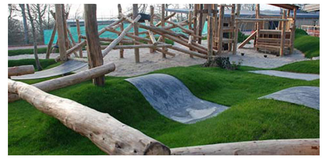
Figure 30. Merging the landscape with play