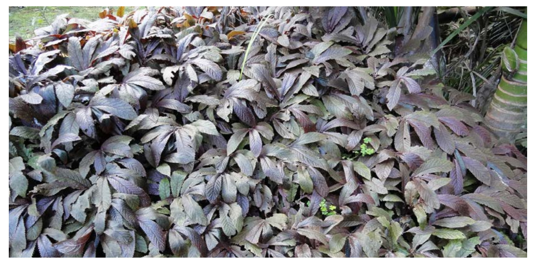
Figure 22. Elatostema rugosum Parataniwha