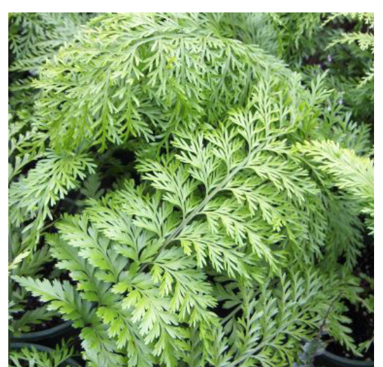
Figure 19. Asplenium bulbiferum Pikopiko