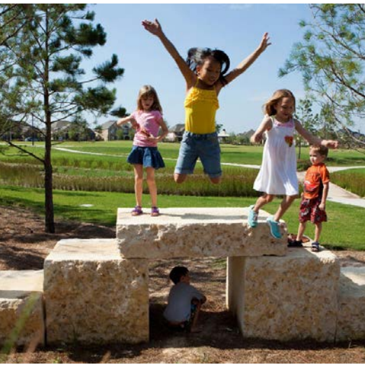
Figure 29. Natural play elements