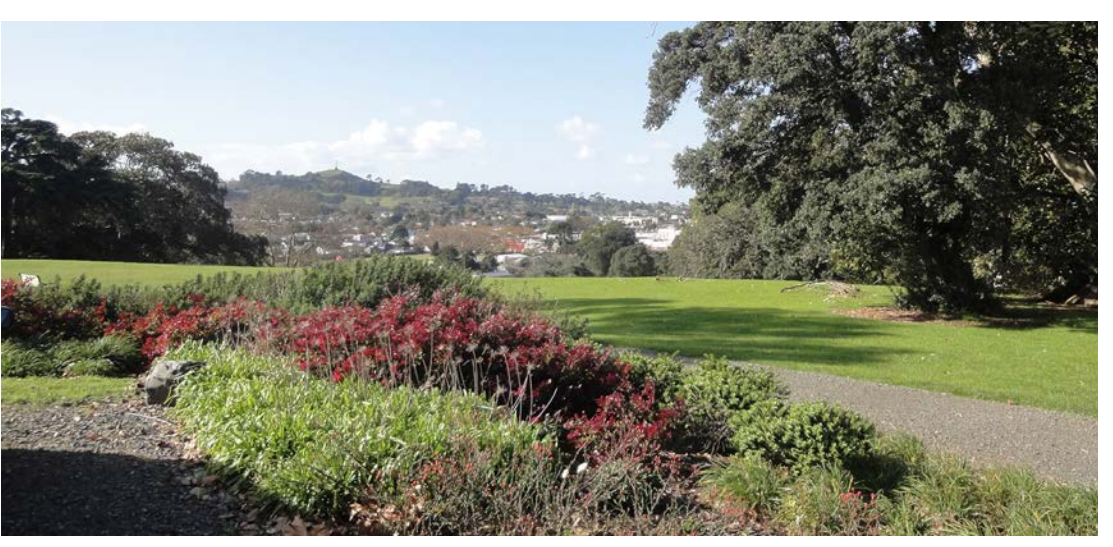
Figure 13. Colourful amenity planting - Monte Cecilia