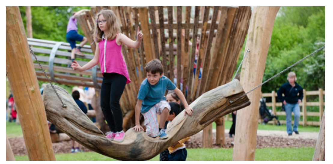
Figure 26. 'Woodland' playground

Possible concepts of playscape to be explored are 'footprints' left from traces of former occupations of the park, nature and woodlands. The natural setting is to be embraced by incorporating natural play through the landscape. Interactive play elements that aim to provide the widest possible variety of activities and a full range of play experiences are to be used. A strong emphasis on the heritage of the park will be a major influencial factor in the design process.