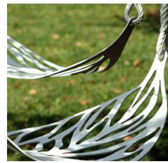
Figure 33. Incorporating nature into detailed design