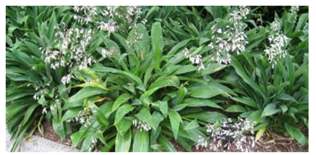
Figure 18. Arthropodium cirratum 'Matapouri Bay' Rengarenga

The indicative plant palette seeks to improve native biodiversity while adding interest and colour to the understory. Crown uplifting, the removal of weeds and underplanting will add colour and neaten the newly aquired plots. Ensure continuity with the rest of the park in the planting design. Low-growing, hardy and evergreen natives such as ferns, carexes and astelias are suggested. Add native edible plants (e.g. ramarama, horopito, herbs and ferns), which would ecosourced and planted diversely to support native fauna. Manage gardens to minimise weed habitat and hence weed growth and the need for herbicides.