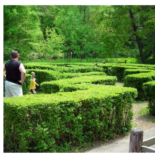
Figure 27. Simple effective interventions