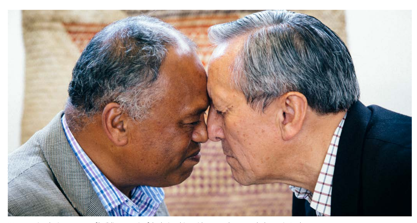
We recognise the importance of building meaningful relationships with mana whenua and whānau in Rodney.

But we acknowledge that there is more that we need to do to connect the local board's work with the aspirations of mana whenua, and we look forward to that journey.