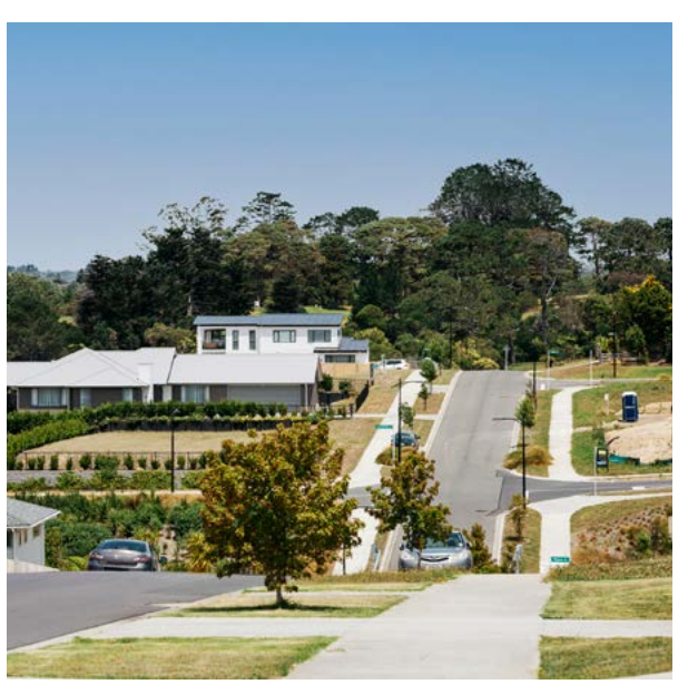
A new subdivision at Riverhead.