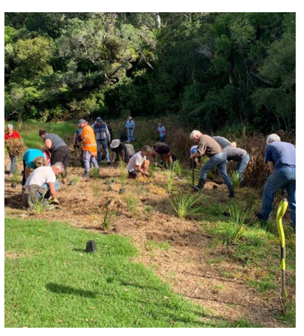
Volunteers plant trees at Matheson Bay Recreation Reserve.