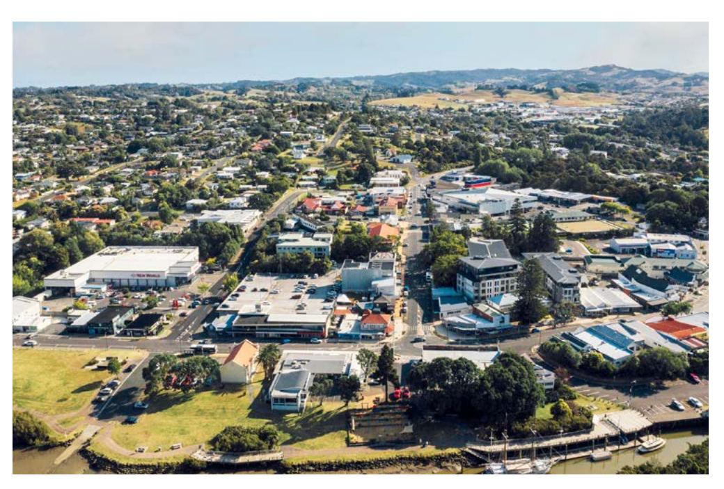
Te Huihuinga Kōwhai (gathering space) will be a new community space next to the Mahurangi River.

Our town centres and villages have seen little improvement for over a decade. We will partner with agencies such as Waka Kotahi NZ Transport Agency, Auckland Transport and Panuku Development Auckland to seek improvements to town centres and villages, and to create better, more usable and attractive public spaces that are focal points for our communities.