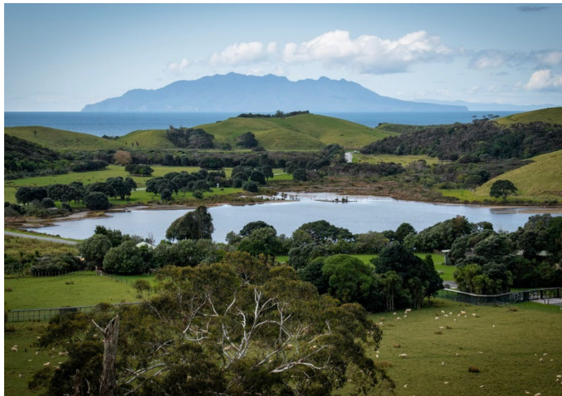
Tāwharanui Regional Park