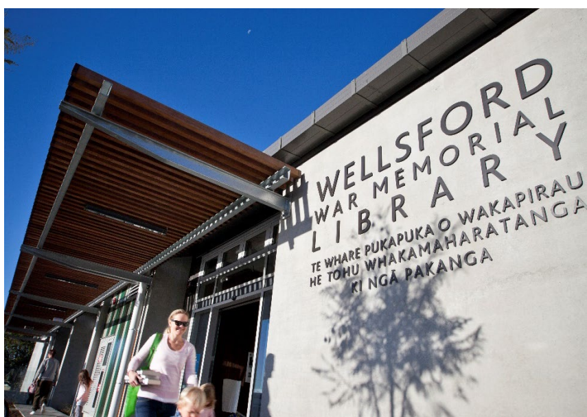
Wellsford War Memorial Library