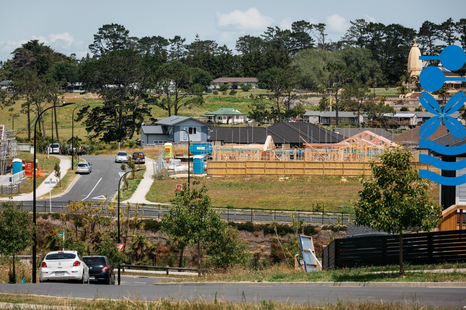
New housing subdivision in Riverhead