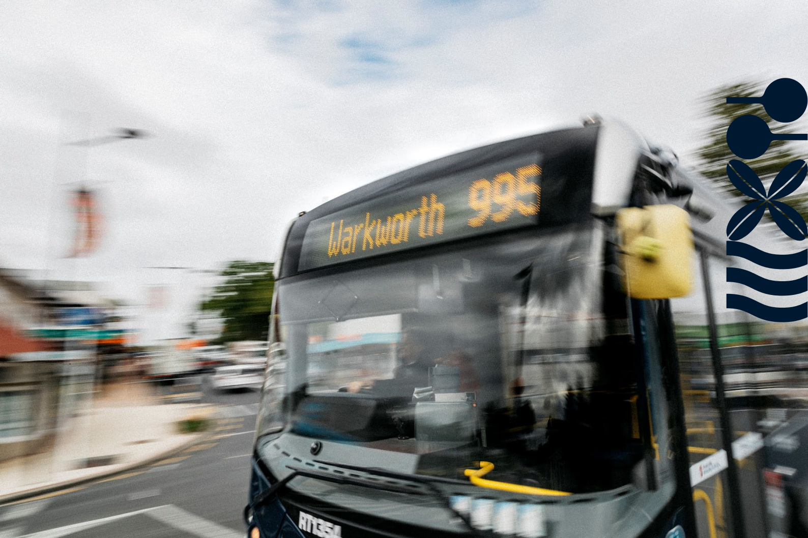
The Wellsford to Warkworth 998 bus