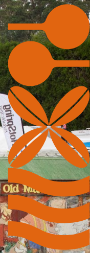
The Kumeū Show