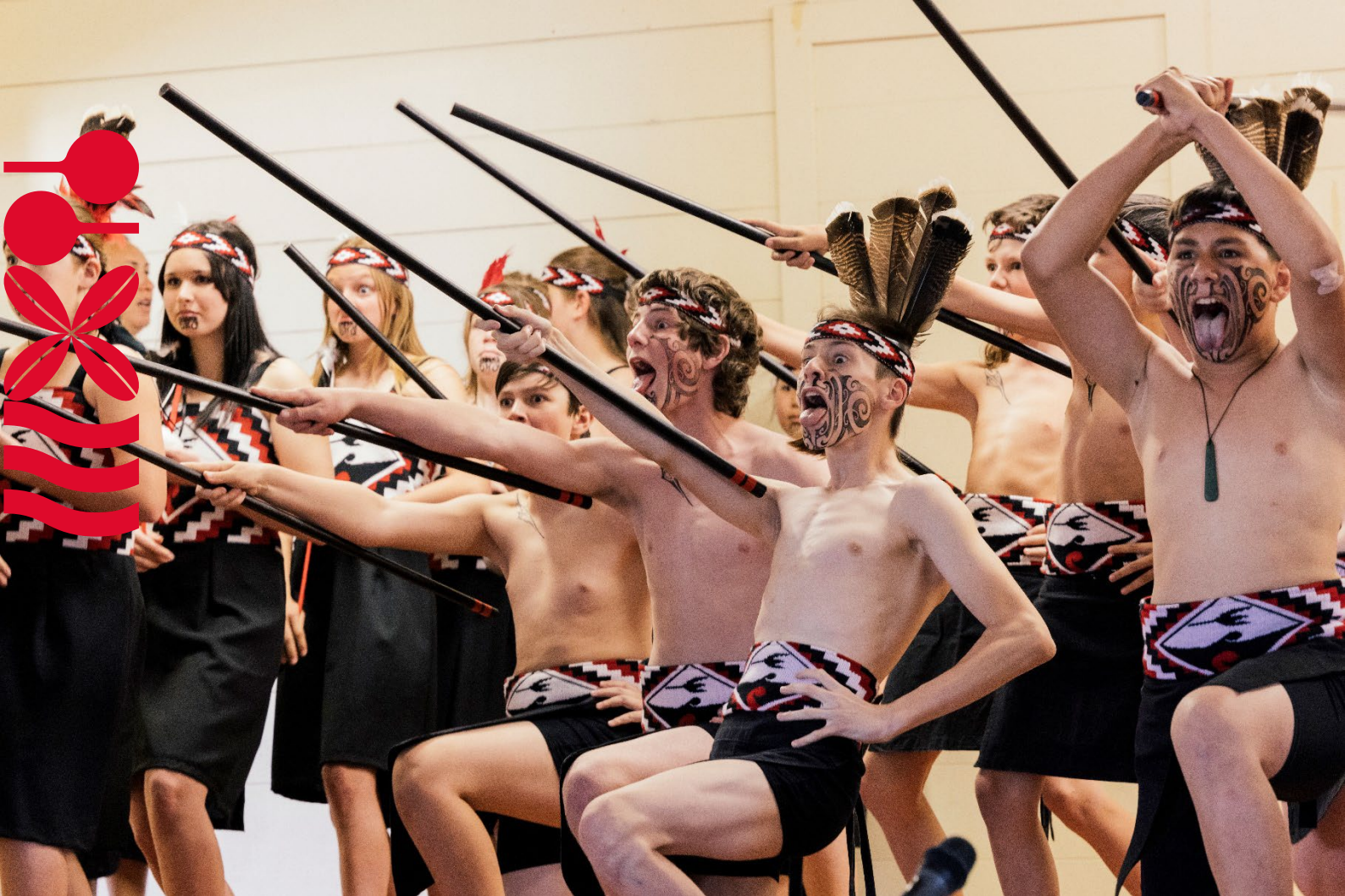
Kapa haka performance by Kaukapakapa School