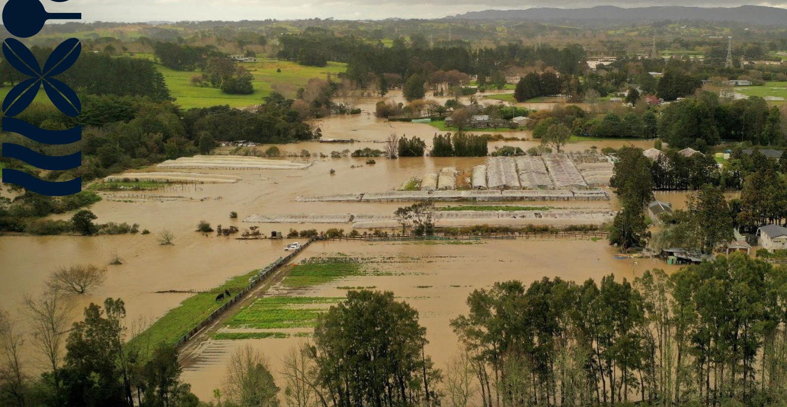
Flooding in Kumeū Huapai.