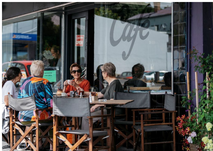
Locals enjoying a café in Rodney