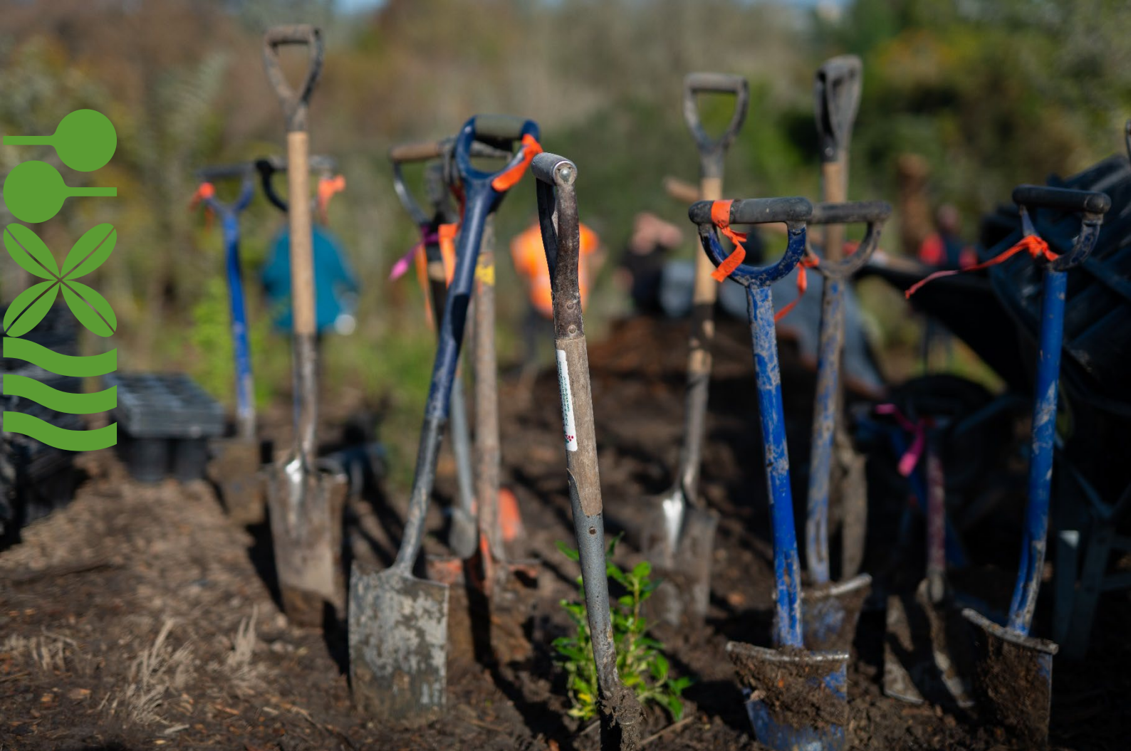
Many environmental volunteers and groups help with planting and pest eradication