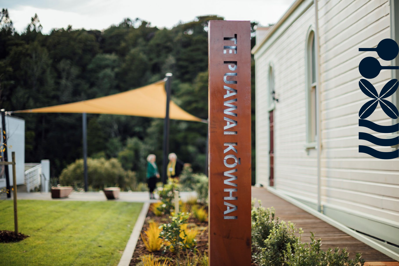
Te Puawai Kōwhai is a public space outside Warkworth Library