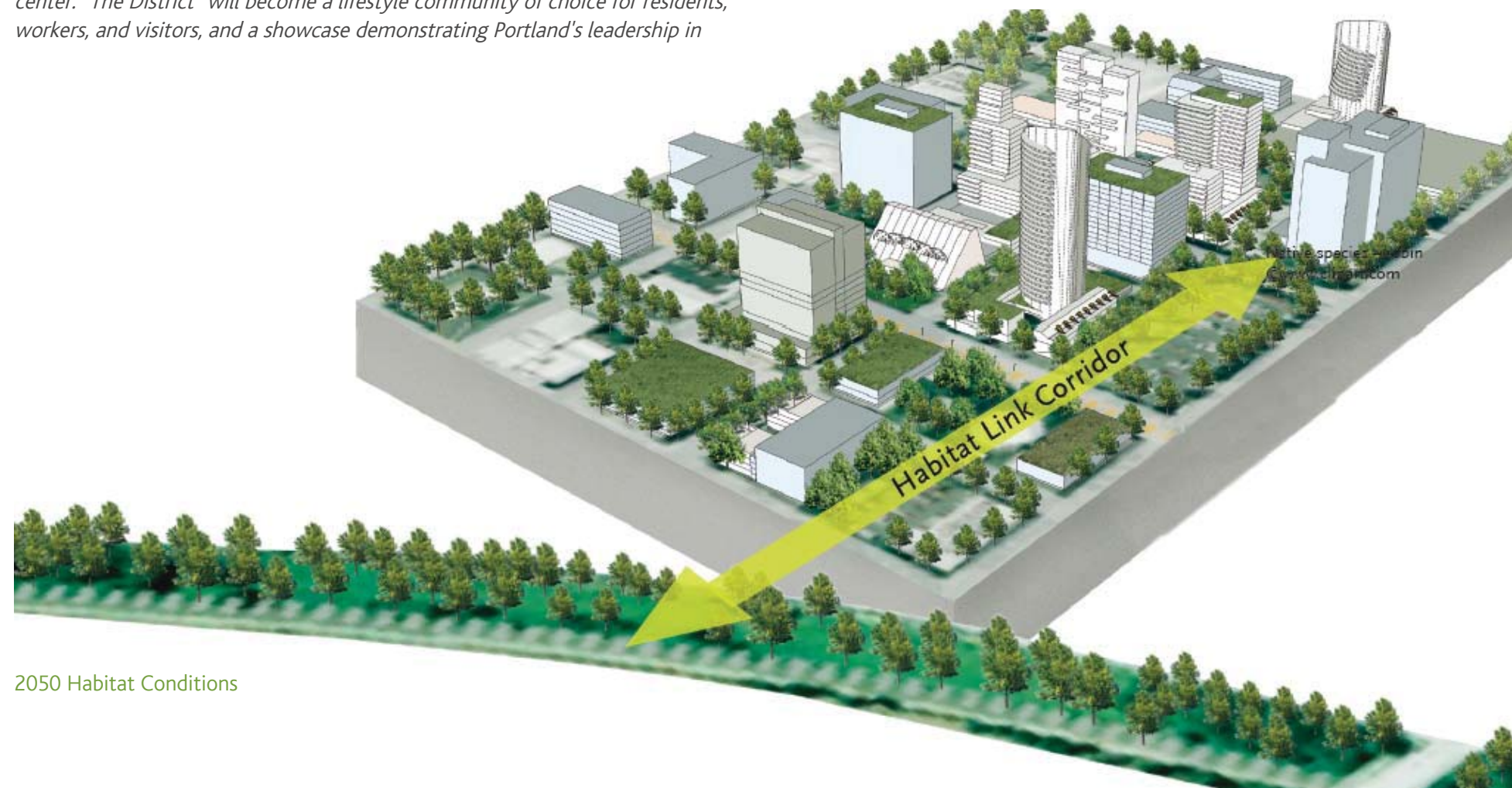
2050 Habitat Conditions