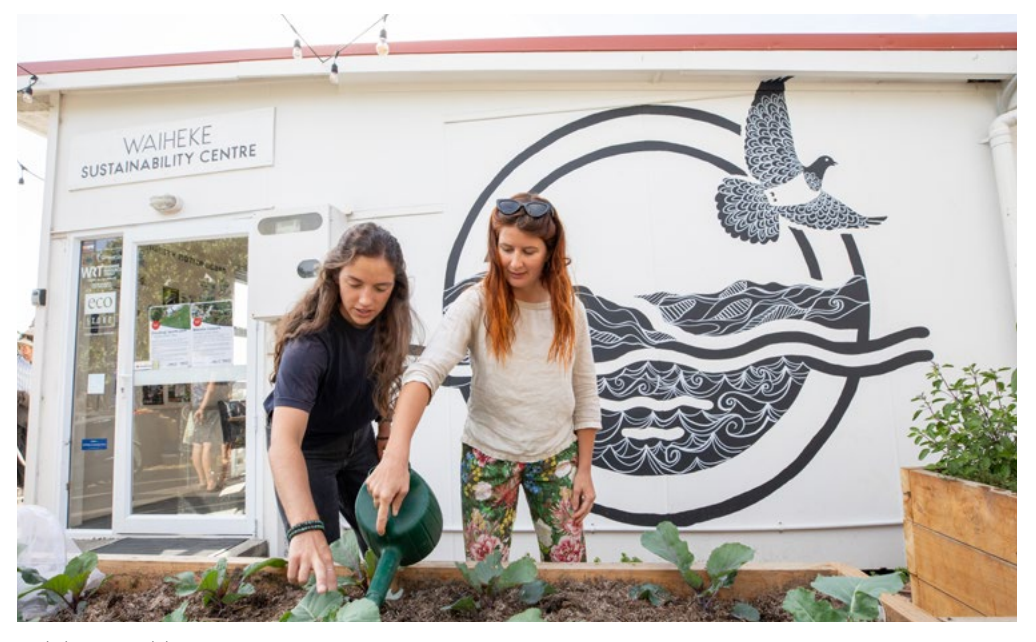
Waiheke Sustainability Centre.

Climate change is central to all local board plans and initiatives, both in terms of climate change mitigation and addressing climate change effects. We will work with our community to prepare for the future.