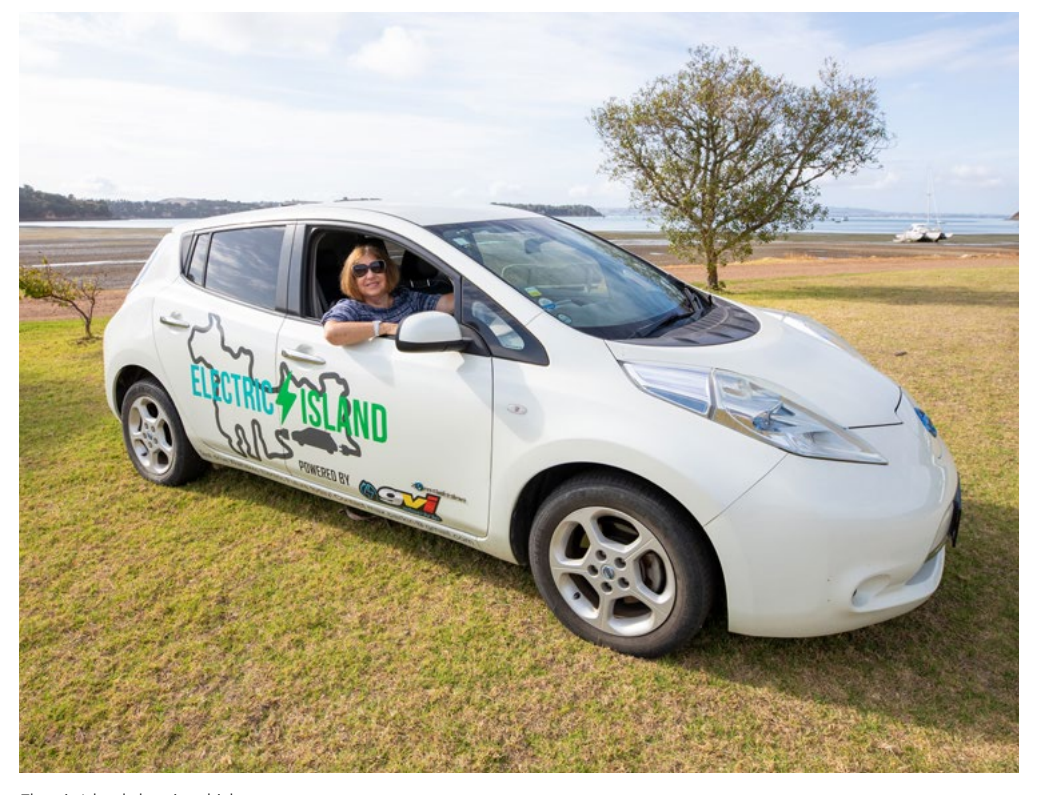
Electric Island electric vehicle.

We are committed to carrying out the following key initiatives to achieve these goals, subject to post COVID-19 pandemic financial constraints.