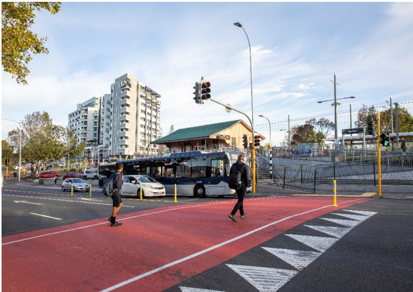
Crossing at Glen Eden Train Station