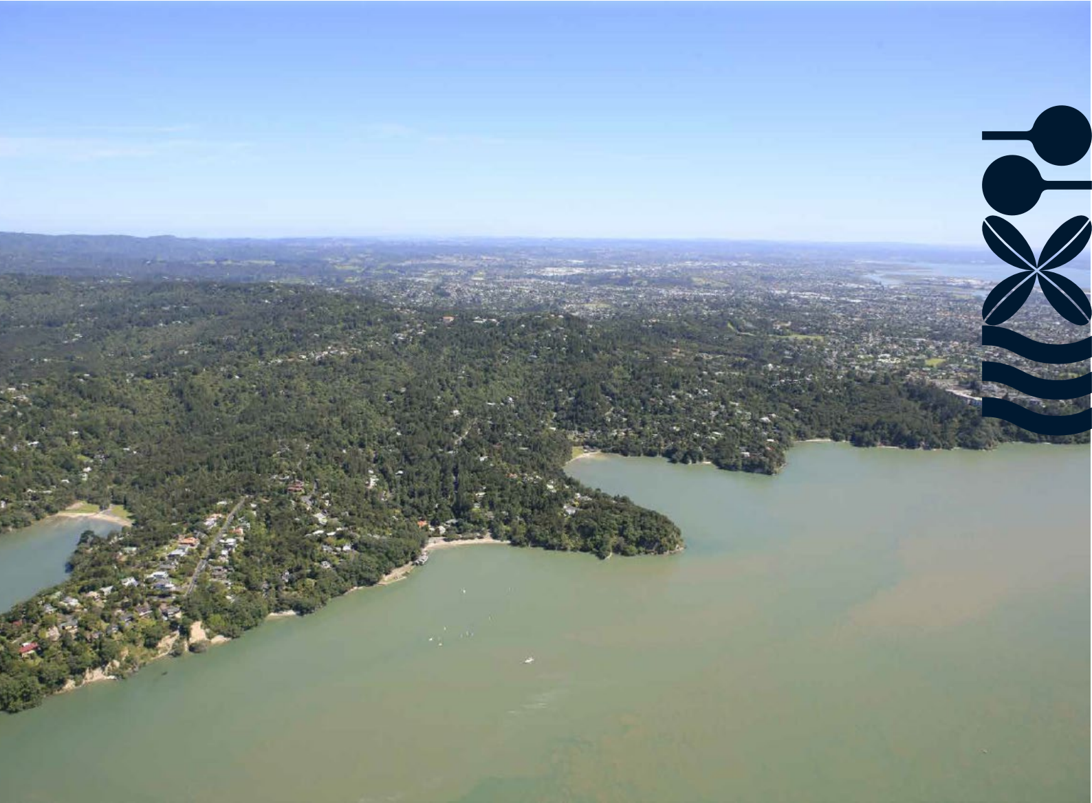
View of French Bay