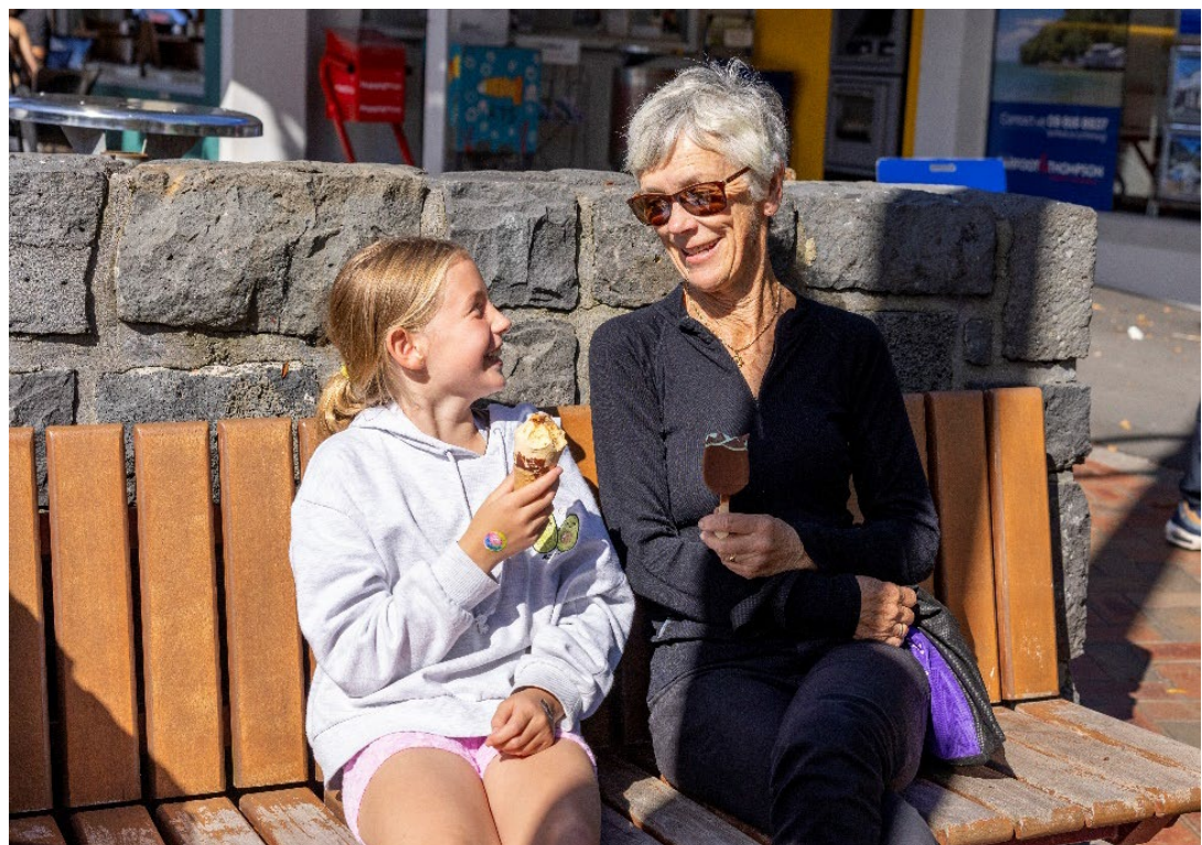
Locals enjoy ice cream at Titirangi Village