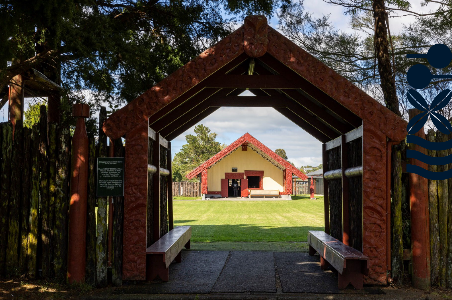
Hoani Waititi Marae, Parris Park