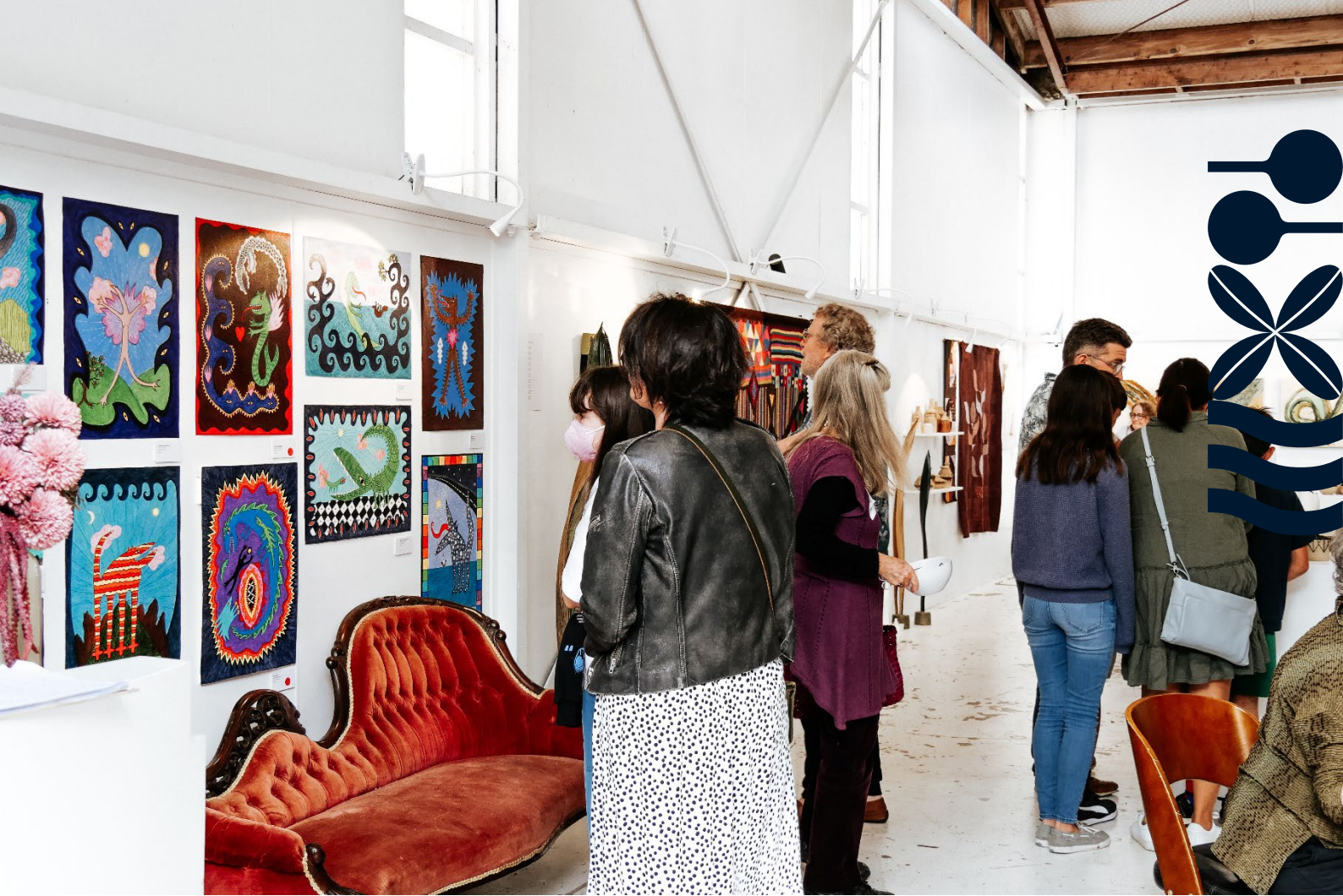
Open Studios Waitākere