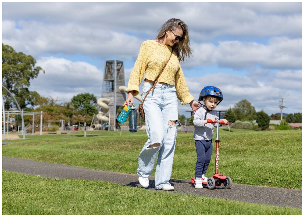
Locals at Parrs Park, Glen Eden