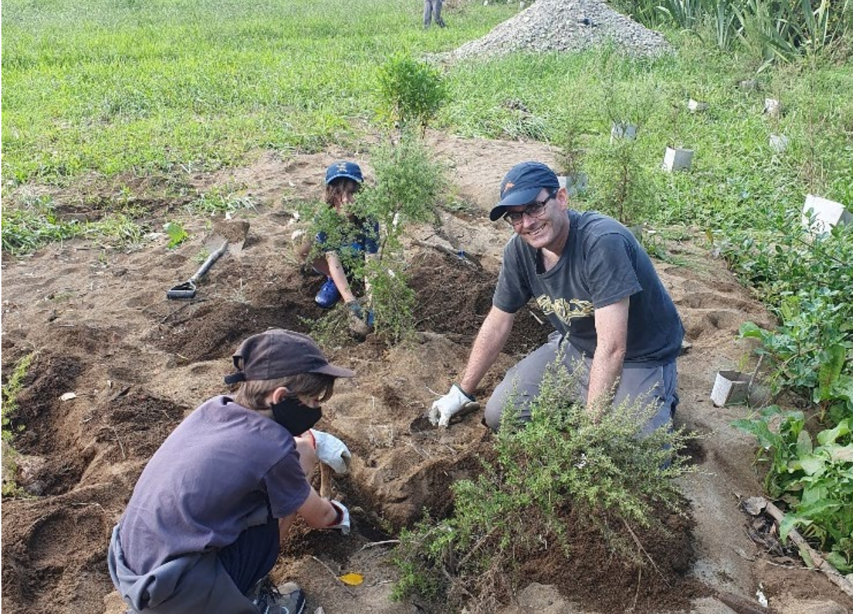
Matuku Link volunteers