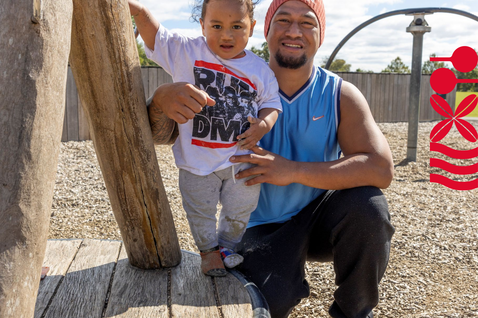
Locals at Parrs Park