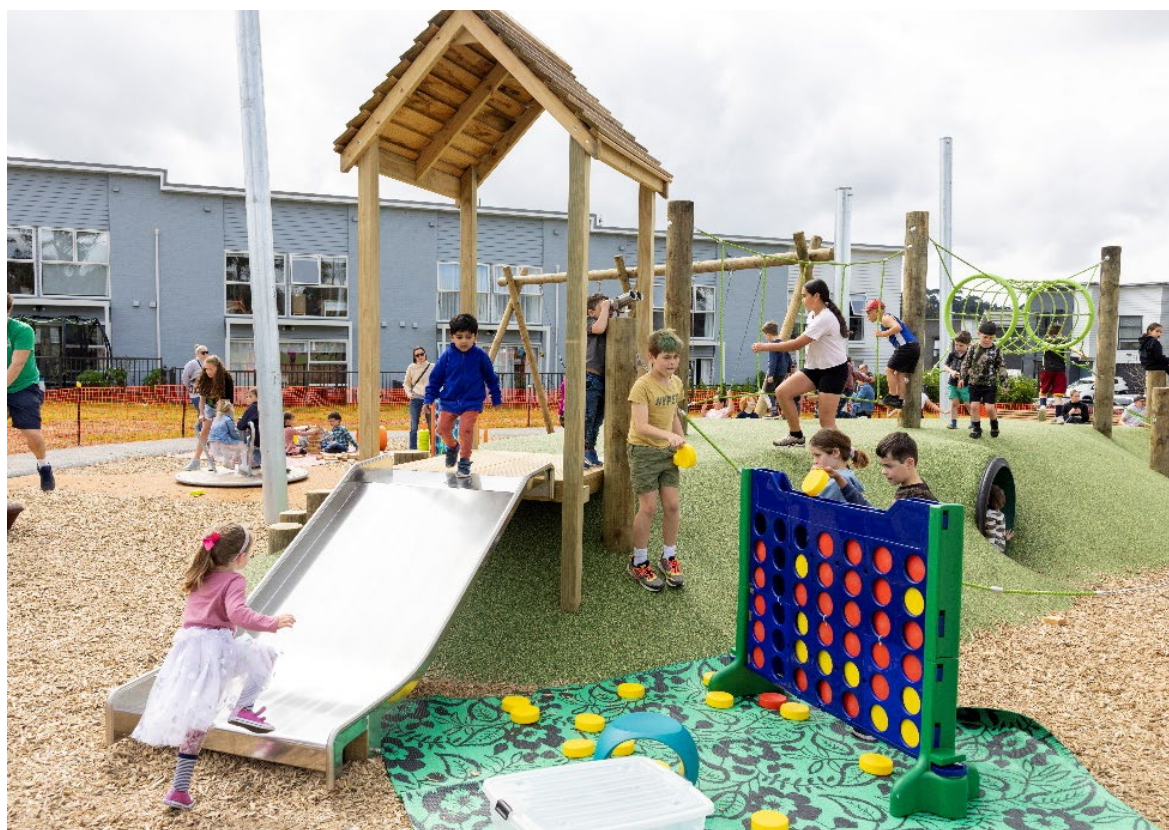
Rangatū playground, Swanson