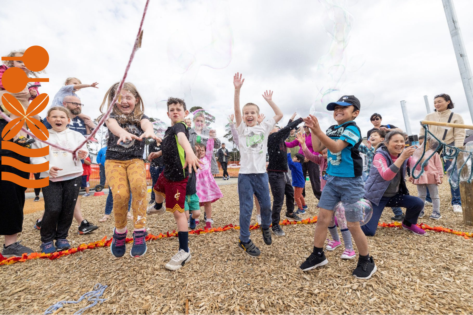
Rangatū playground, Swanson