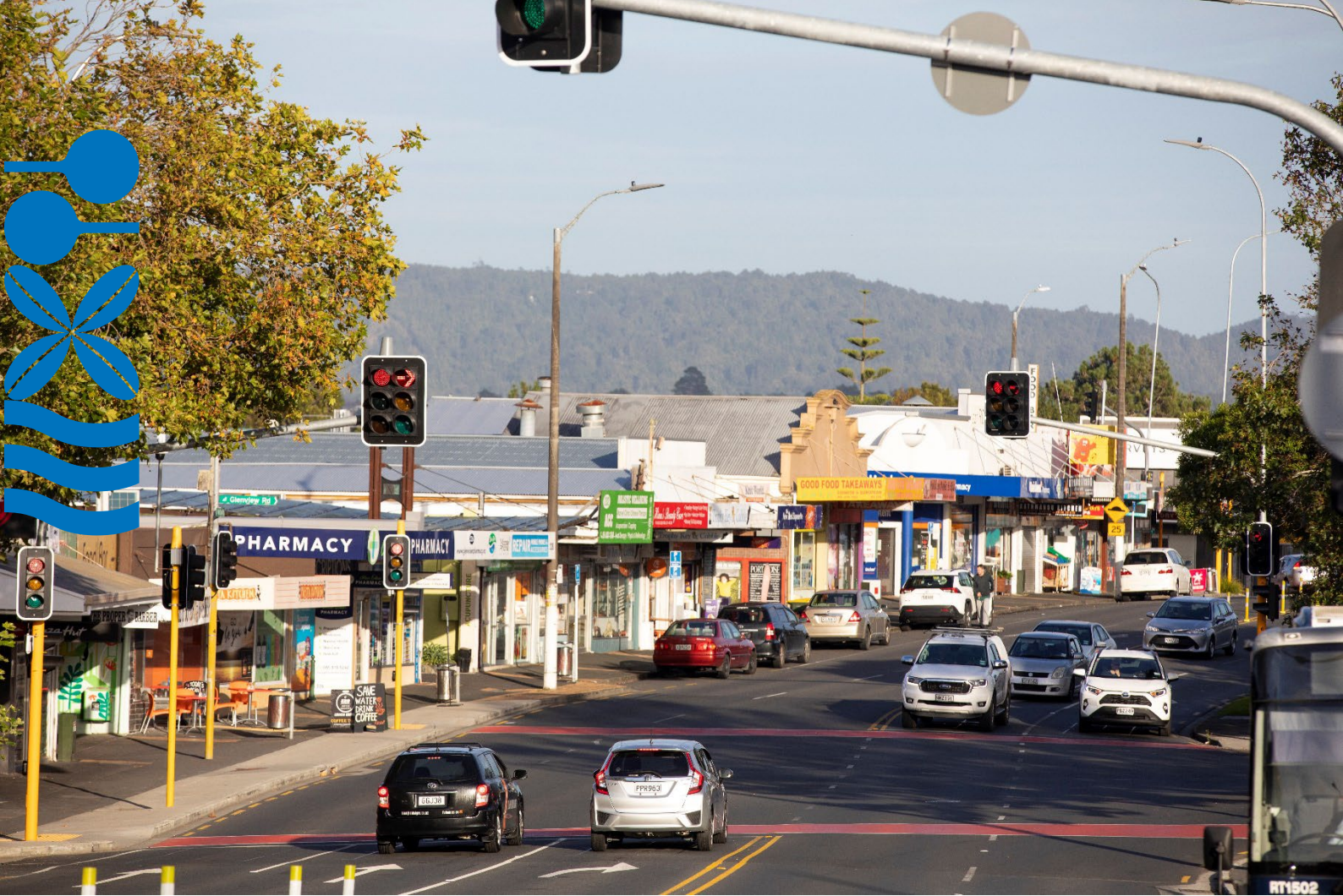
Glen Eden town centre