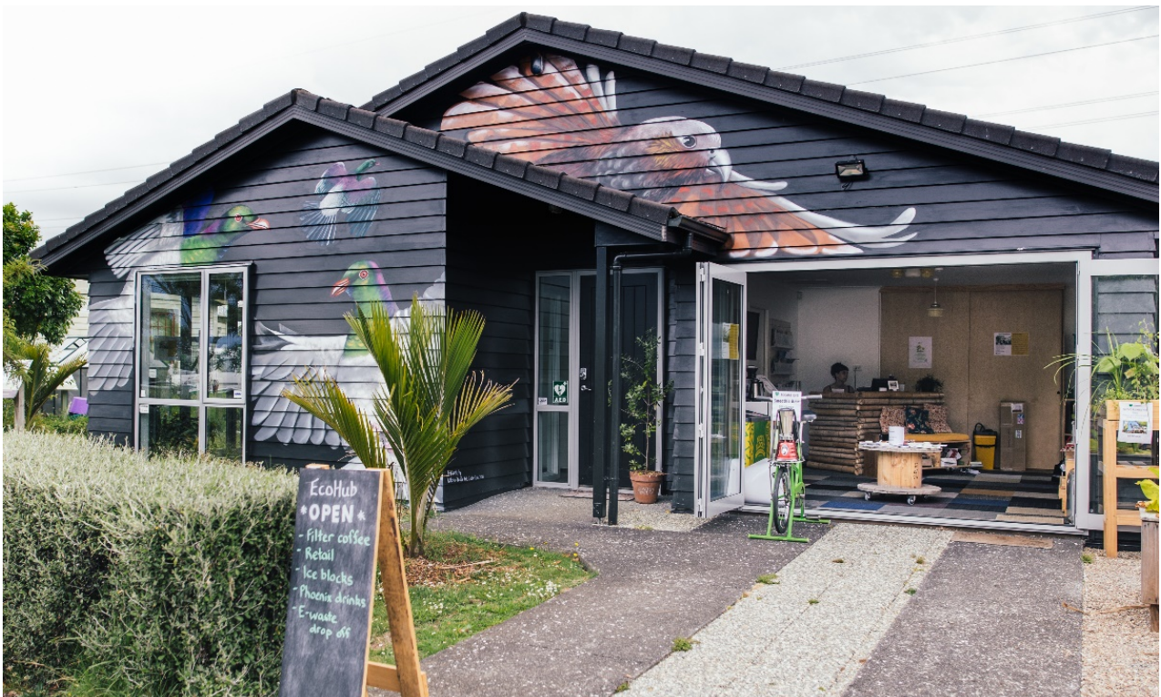
Figure 6 EcoHub and Store at EcoMatters, New Lynn.