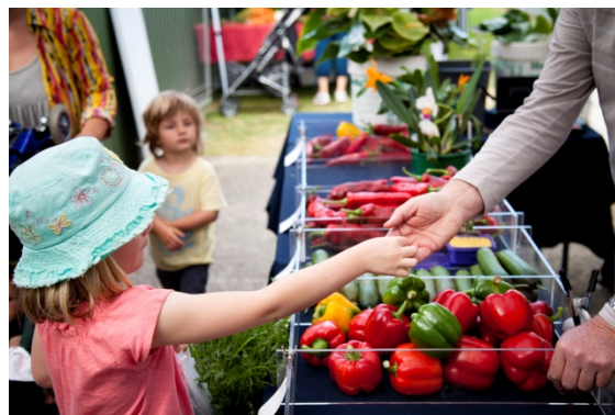
Figure 5 Shop local and in season