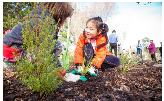
Figure 11 Planting at Chalmers Reserve, Avondale.