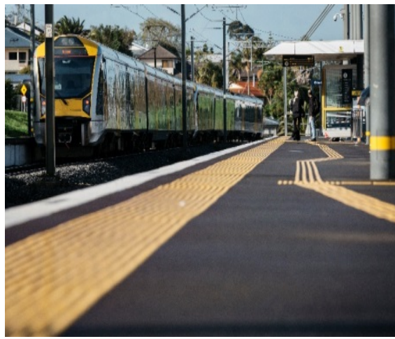
Figure 2 Everyday lifestyle choices we can all make to save money, have a healthier life, and care for the planet.