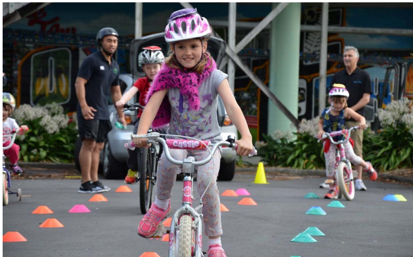
Figure 10 Kids' Cycle Training