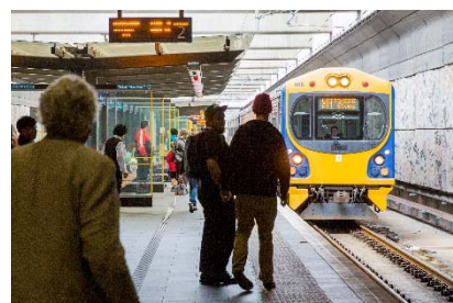
Figure 7 Walk, cycle, or catch public transport more. Cycle photo by EcoMatters Environment Trust.