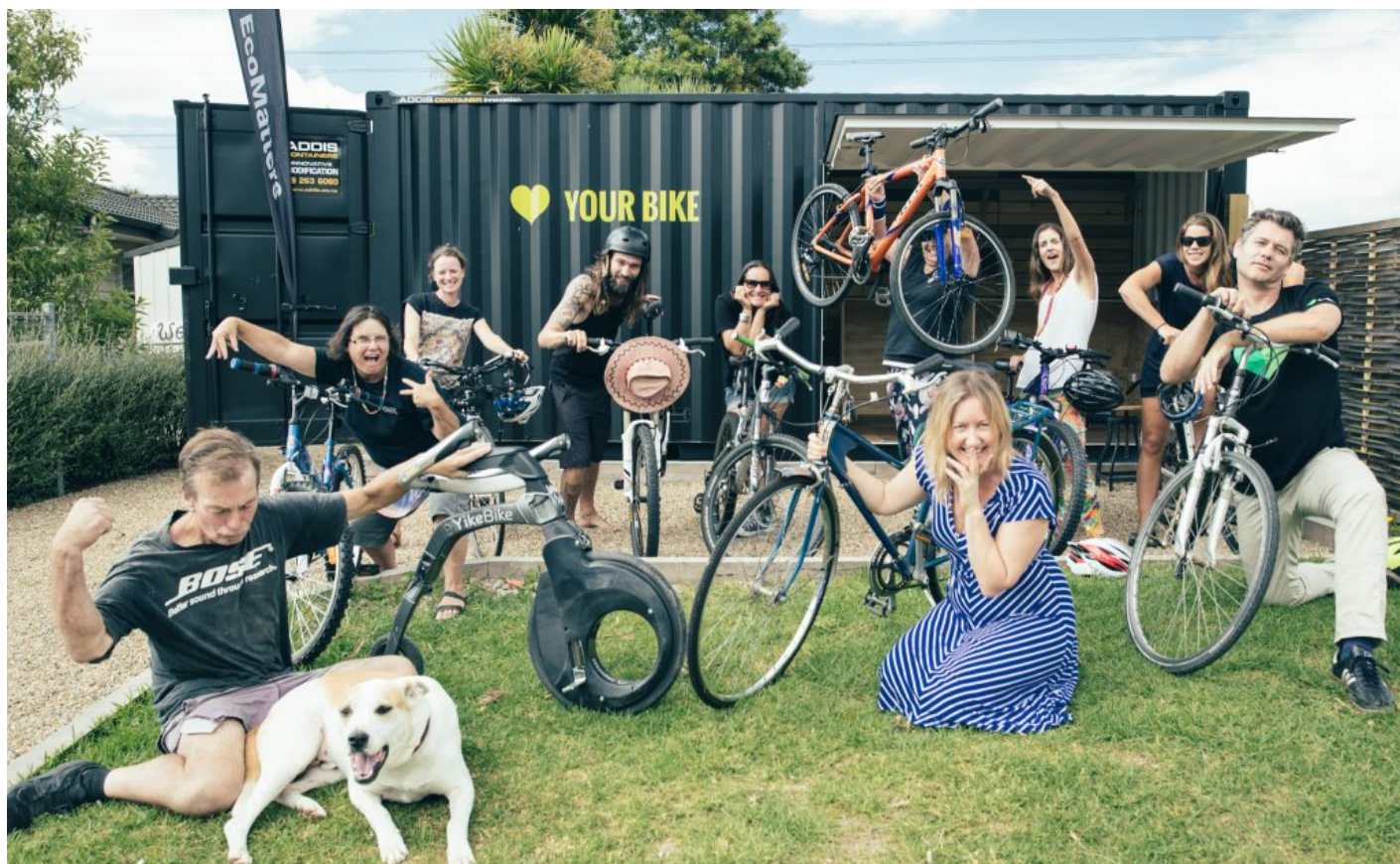
Figure 9 Bike Hub by EcoMatters.