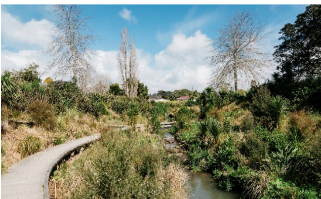
Figure 8 La Rosa Garden Reserve, Green Bay.