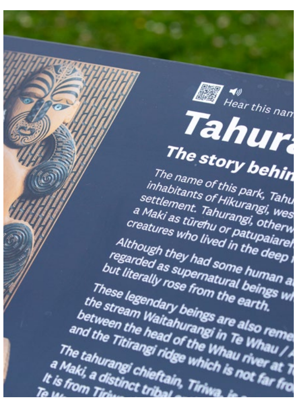
Dual language signage installed at Tahurangi/Crum Park