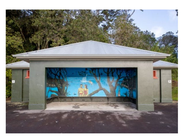
Changing room mural Blockhouse Bay