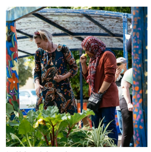
Avondale Community Centre garden