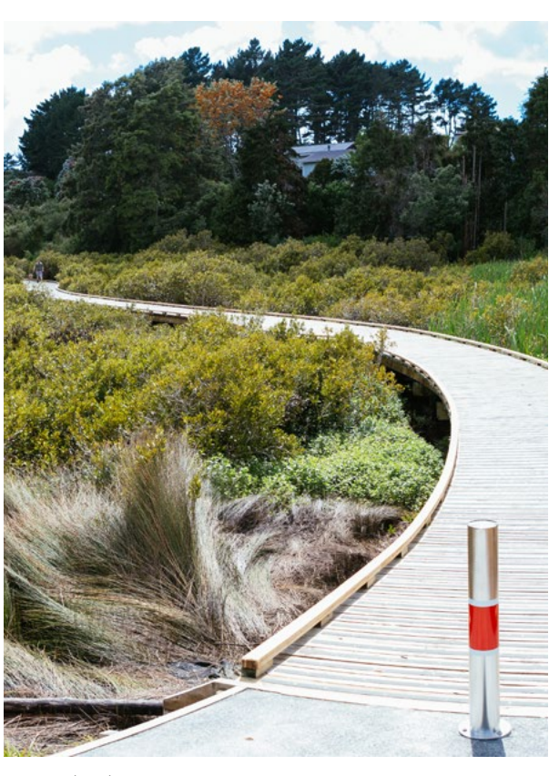
Heron Park pathway