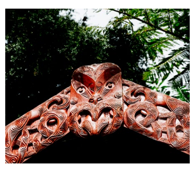
Hoani Waititi Marae