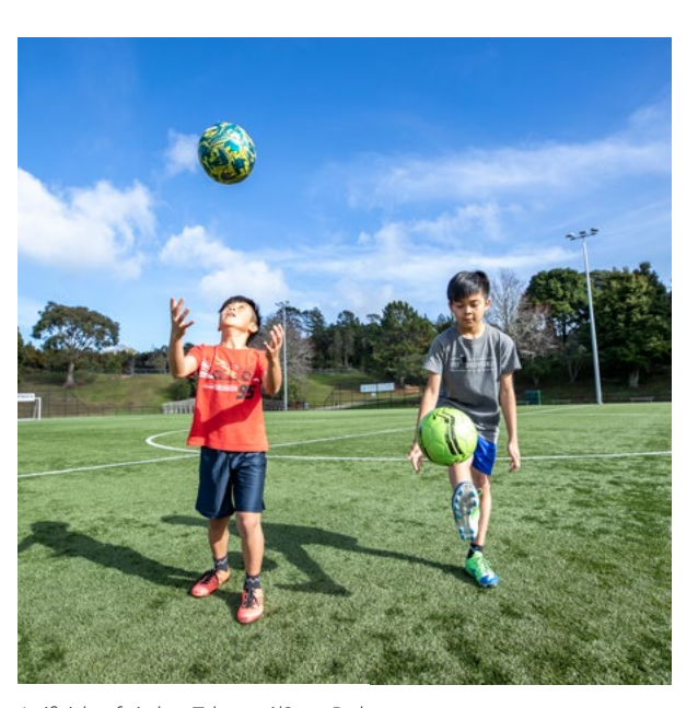
Artificial turf pitch at Tahurangi/Crum Park