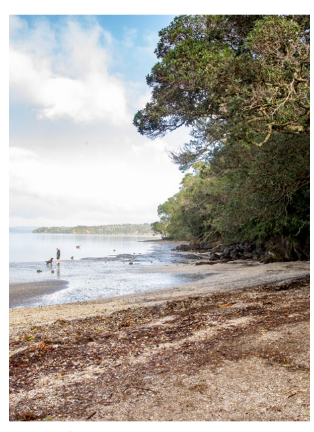
Green Bay Beach