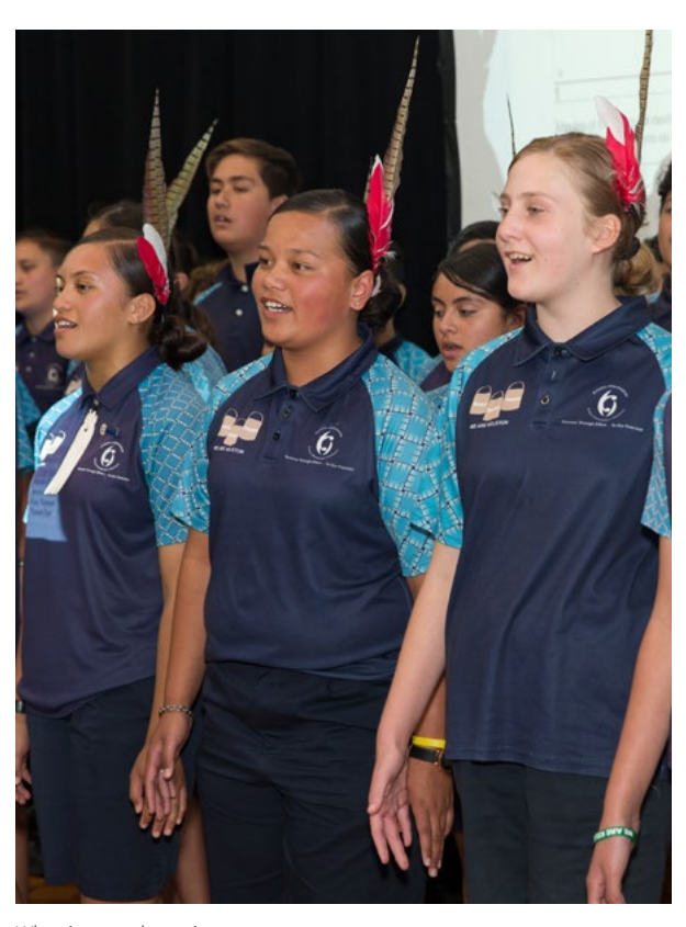
Whau inaugural meeting