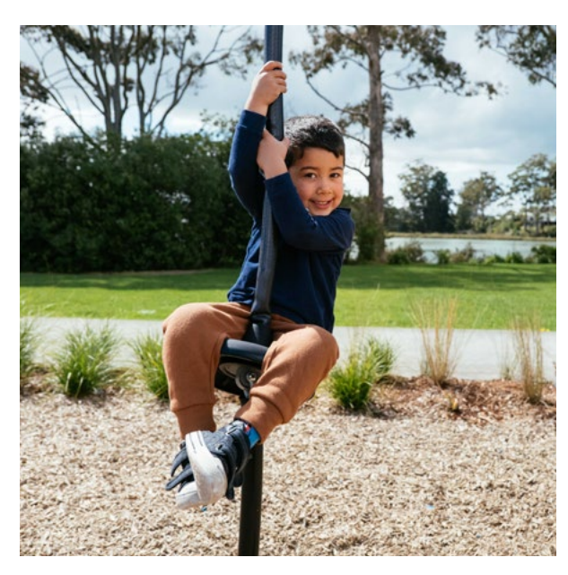
Archibald Park playground