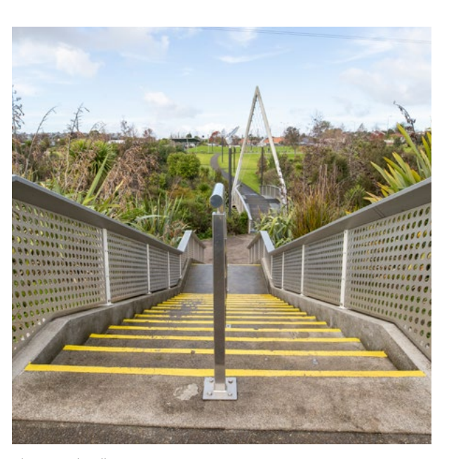
Olympic Park walkway