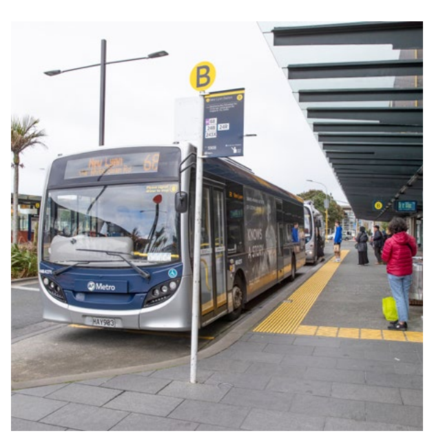
New Lynn Transport Centre