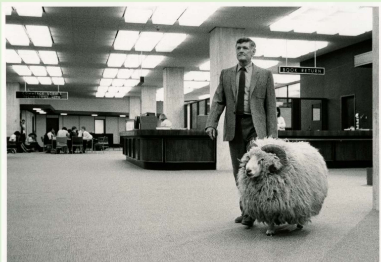
Ground floor, Auckland Central Library, Lorne Street, 22 February 1983

In the 1960s, Dr Francis Dry from Massey University had developed a breed of Drysdale sheep with wool suitable for carpet manufacture. We assume that the new carpet in the Central Library building was made from New Zealand Drysdale wool. This image was later published in the Auckland Star on 7 March 1983.