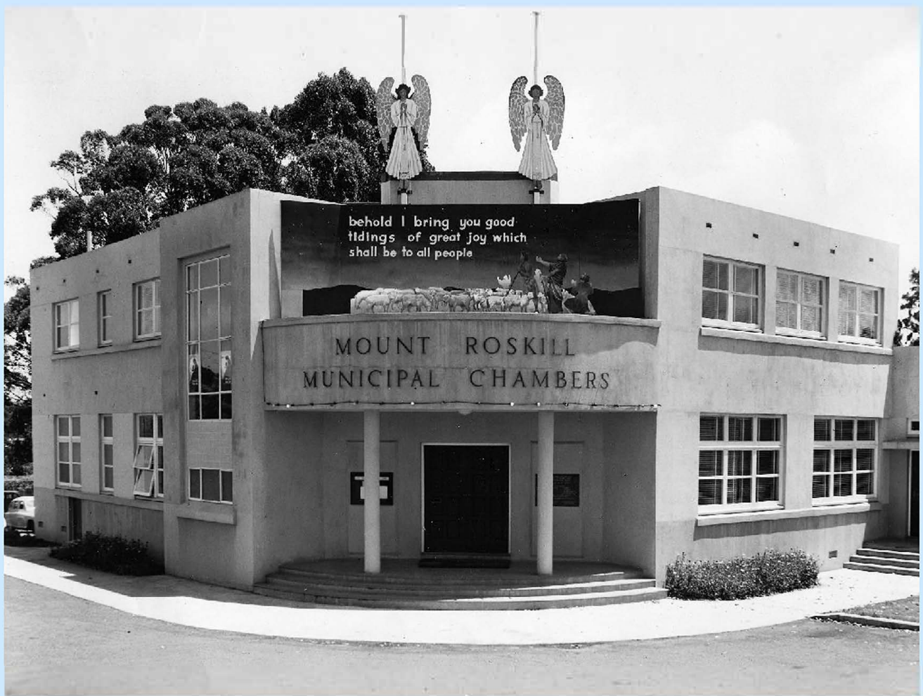
Mount Roskill municipal chambers at Christmas, 1965

The Archives team would like to wish you a very merry Christmas and a happy New Year.