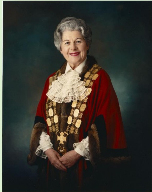
Mayor Catherine Tizard

Catherine Anne Tizard ONZ, GCMG, GCVO, DBE, QSO, DStJ. 4 April 1931 to 31 October 2021.