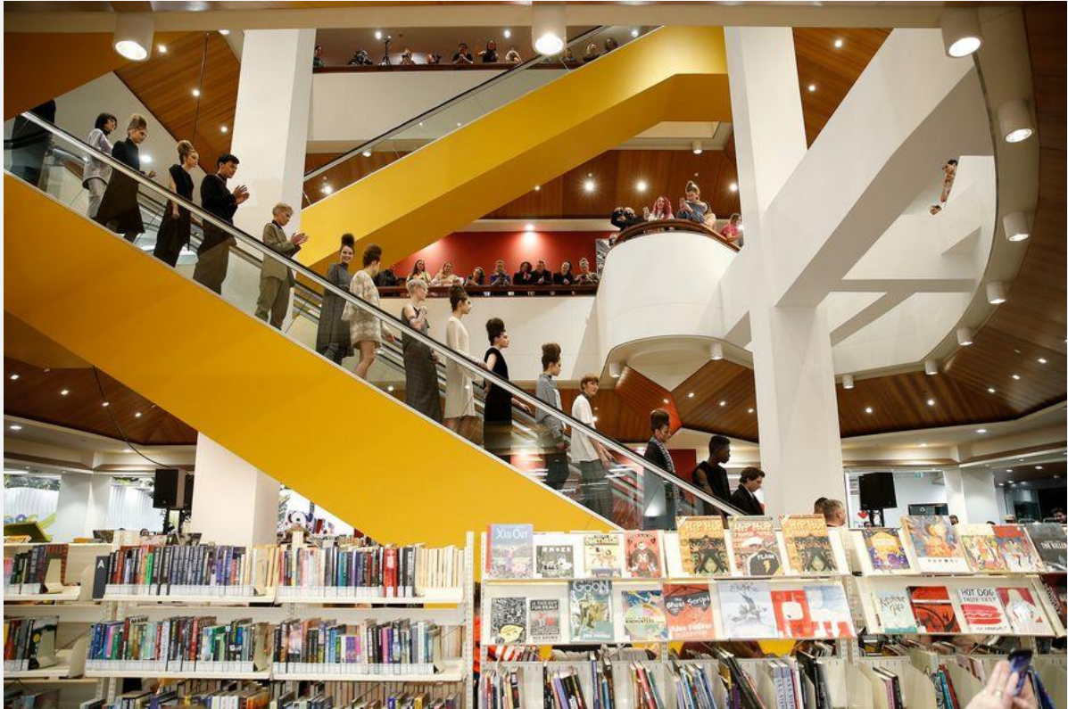
Zambesi autumn/winter 2020 collection at Auckland Central Library, 29 August 2019

With a budget of $1.6 million and the council contributing $40,000, the first ever New Zealand Fashion Week (NZFW) opened on 23 October 2001 with shows from many well-known New Zealand designers attended by over 200 buyers and 100 media representatives. For many years NZFW was an invitation only event for the fashion industry but was opened to the public in 2008. The relationship between NZFW and Auckland Council continues today, with the council providing free fashion-related activities and programmes that sit alongside the official Fashion Week events.