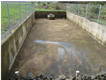
Open sand filter constructed in-situ