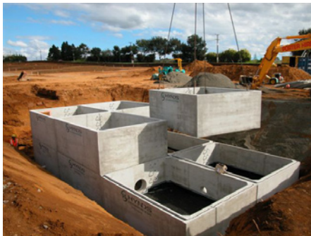
Pre-cast sand filter chambers being installed

Sand filters are designed to separate debris from the runoff, filtering the remaining flow. The most commonly used sand filters in Auckland are prefabricated sand filter units, fitted with components and predrilled for connections. These sand filters are usually buried underground, saving space in built-up areas.