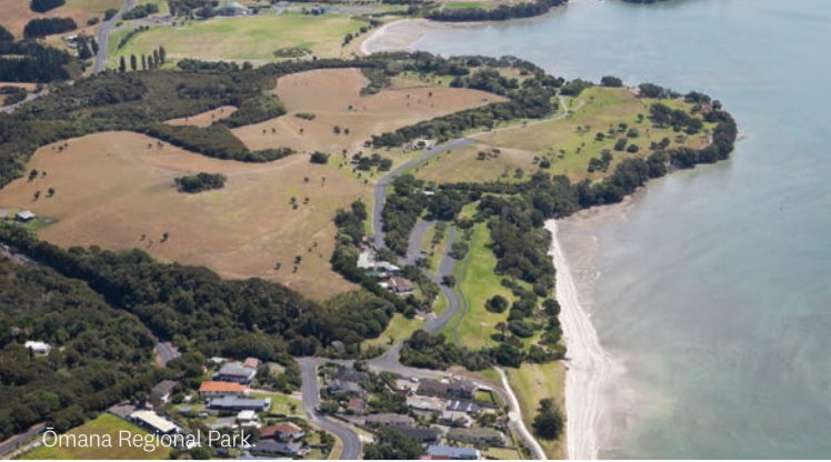
Ōmana Regional Park