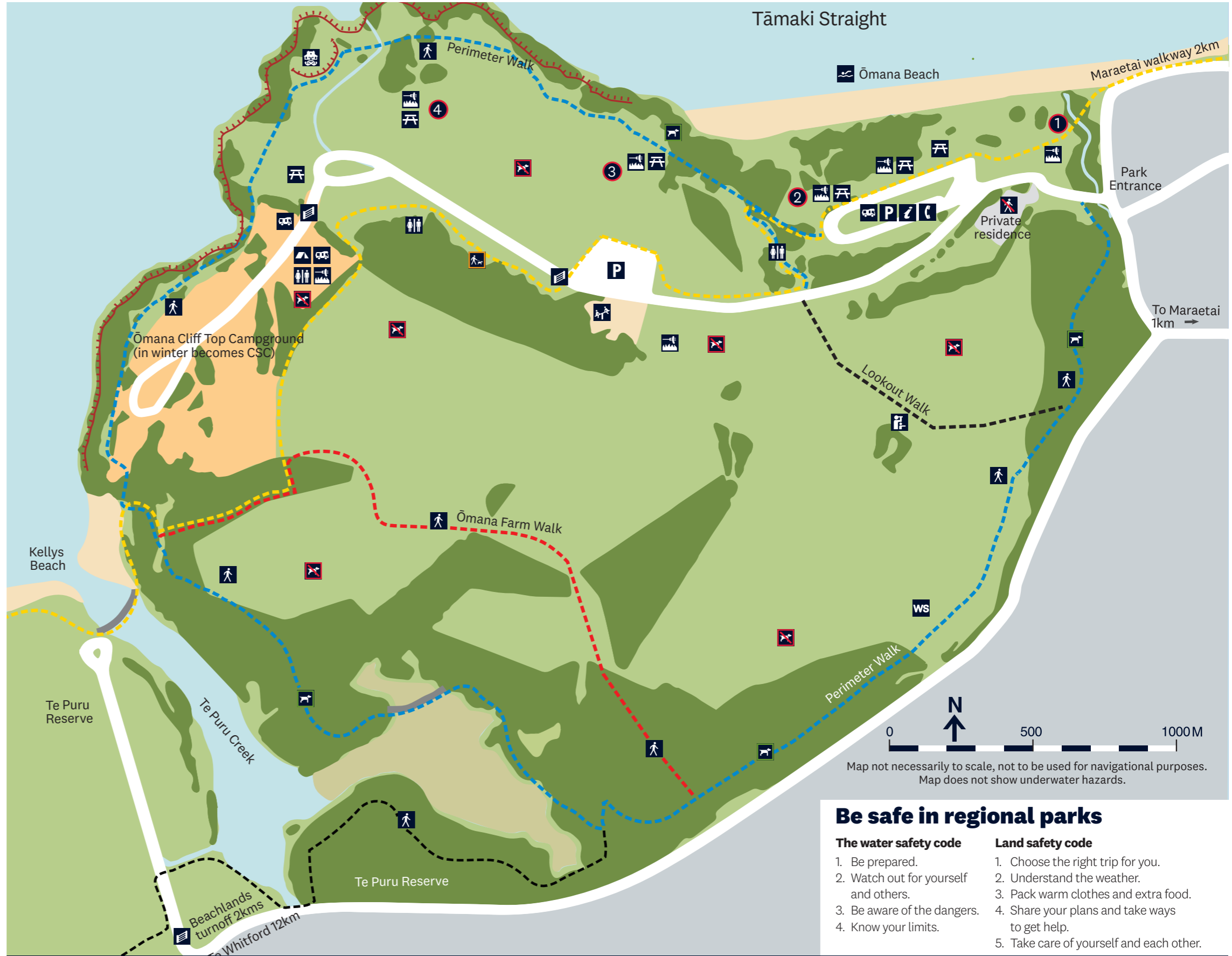
Map not necessarily to scale, not to be used for navigational purposes. Map does not show underwater hazards.

To contact a park ranger use the phone at the information board just inside the park entrance and follow the instructions. If using a mobile phone call 09 301 0101 .