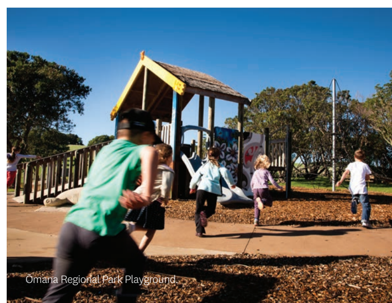
Ōmana Regional Park Playground

Ōmana has sheep and some friendly goats to come and see. You may also be lucky to occasionally see our park ranger moving our sheep flocks with their farm dogs.