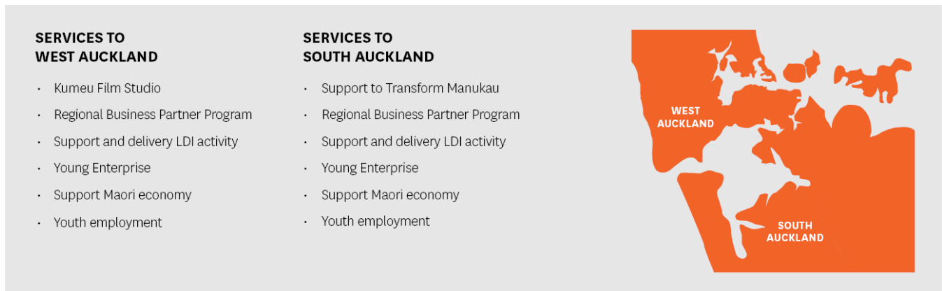
Figure 4: Current ATEED support to West and South Auckland

While ATEED provides localised support across Auckland the need to focus on areas of less prosperity, notably South and West Auckland, is prioritised. As figure 4 outlines ATEED provides a number of services to these regions including a number of focused interventions notably the Kumeu Film Studio (West Auckland) and strategic input into the Pānuku Development Auckland led Transform Manukau initiative (South Auckland). ATEED will continue to focus on initiatives that deliver value to these less prosperous areas.