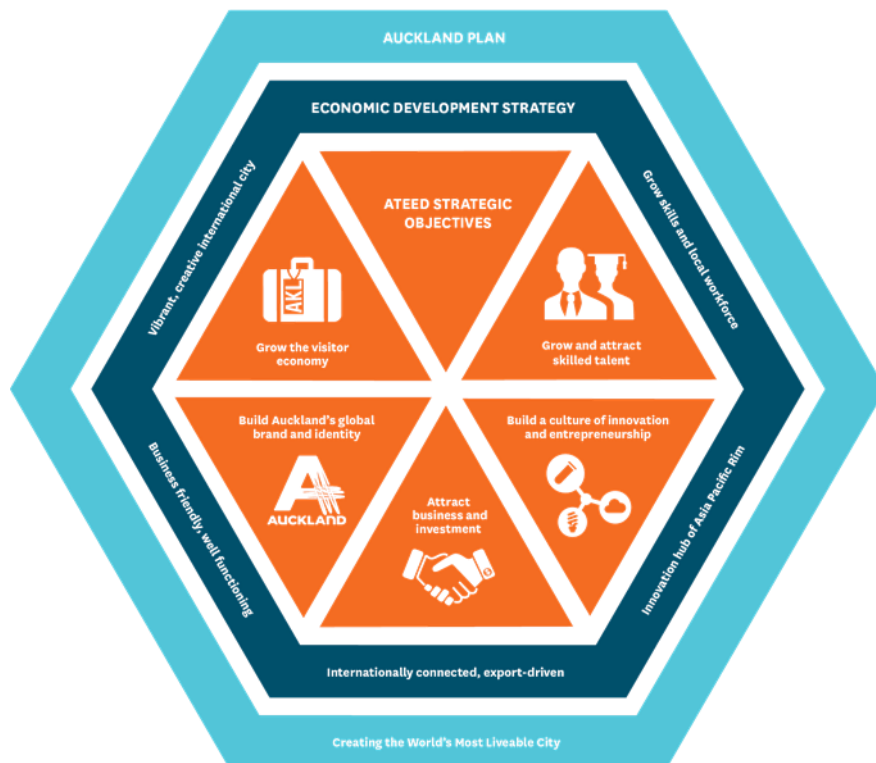
Figure 1 – ATEED's Strategic Framework 2

Through these objectives, ATEED can connect Auckland-wide strategies (the Auckland Plan and Economic Development Strategy) and ATEED's ongoing strategic interventions, growth programmes and projects. The framework below provides the organisation with focus on those areas of ATEED's role that will make a difference to Auckland both regionally and locally. The key strategic objectives are supported by more detailed action plans, investment proposals and delivery partnerships.