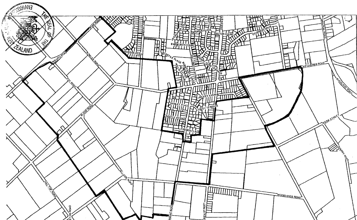
Tutaeenu (North Pukekohe Hill) Catchment Area

September 1999 Scale: 1:15498 Printed 29/10/1999 11:07:24 am