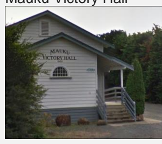
Mauku Victory Hall