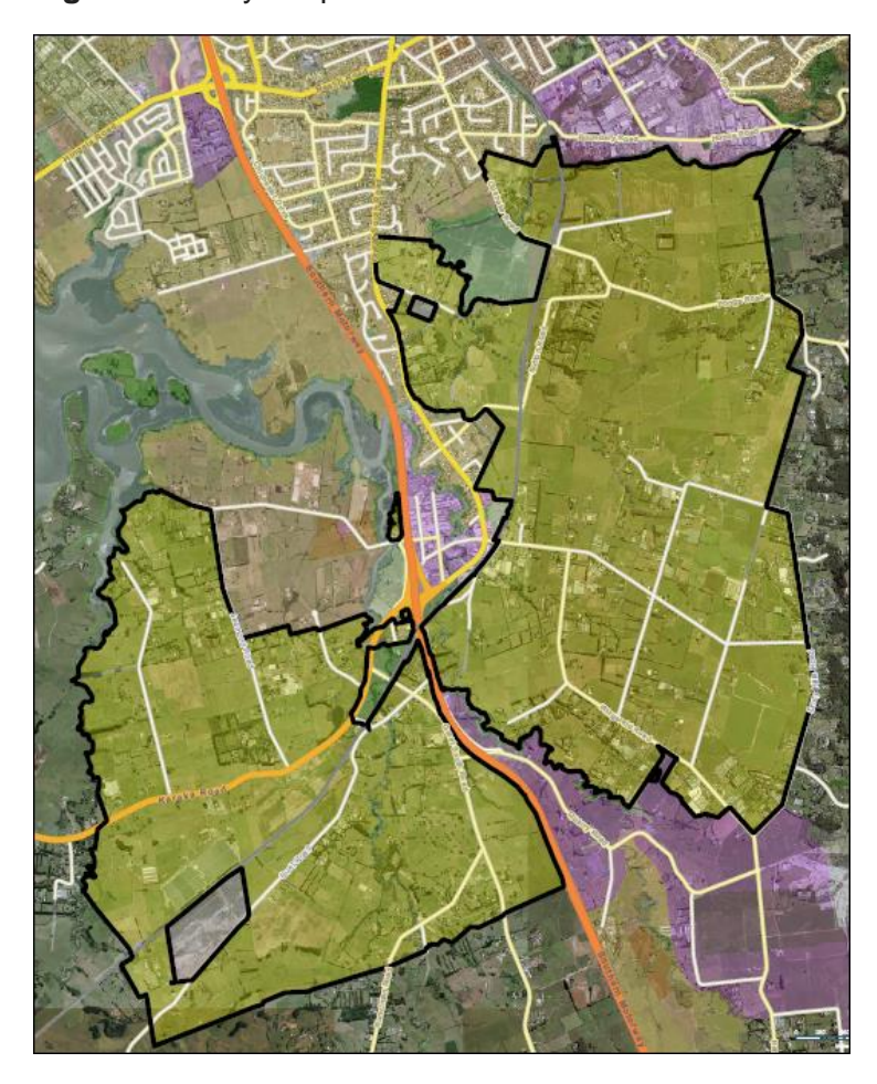
Figure 1: Drury – Opāheke Structure Plan area

The north-west sector of the Drury Future Urban Zone is scheduled to be development ready in 2018-2022. The remainder of the Drury Future Urban Zone is scheduled to be development ready in 2028 – 2032. Actual development yields may differ from these estimates as structure planning for the area enables further refinement of the possible number of homes and the estimated population.