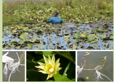
Rohan Wells, NIWA

Mexican water lily is a perennial bottom-rooted aquatic herb with floating heart-shaped leaves and yellow flowers borne above the water surface from October to December. It forms dense mats which can reduce dissolved oxygen levels in the water column by preventing gas exchange between water and air, and may suppress submerged aquatic plants by shading. Impacts on fish, zooplankton and other species resulting from low dissolved oxygen are probable.