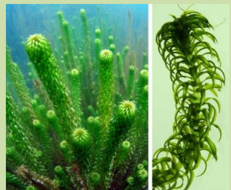
Rohan Wells, NIWA

Oxygen weed is a bottom-rooted submerged perennial aquatic herb with downward curving leaves, arranged in spirals on the stem. It is capable of forming dense stands; displacing native aquatic herb species, altering habitat availability for fish and invertebrates, and affecting dissolved oxygen levels by reducing gas exchange. The stands can also impede recreational water access to water bodies.