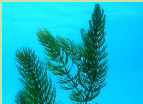
Rohan Wells, NIWA

Hornwort is a perennial submerged aquatic plant up to 7m tall which can be anchored to sediment by stems, or forms free-floating mats. Leaves are 10-40mm long, narrow, branched and whorled forming complex architecture. Hornwort forms dense monospecific stands which can displace all native submerged vegetation down to 15m depth. The dense stands alter water flow, increase flooding risk and impede recreational access of waterbodies. Because it can grow to greater depths than other aquatic weeds, it is the species likely to have greatest impacts on deep-water charophyte meadows. Kōura are also likely to be especially impacted due to requirement for open habitat.