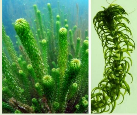
Rohan Wells, NIWA

Oxygen weed is a bottom-rooted submerged perennial aquatic herb with downward curving leaves, arranged in spirals on the stem. It is capable of forming dense stands; displacing native aquatic herb species, altering habitat availability for fish and invertebrates, and affecting dissolved oxygen levels by reducing gas exchange. The stands also can impede recreational water access to water bodies.