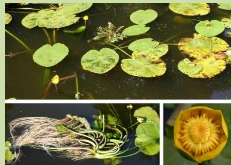
Rohan Wells, NIWA

Yellow water lily is a perennial aquatic plant with both floating oval leaves and submerged very thin leaves. Flowers are yellow and held above the water surface in spring-summer. Dense mats may suppress submerged aquatic plants by shading and can have indirect impacts on plankton by providing refuges from fish predation. Invasion can alter patterns of nutrient storage in sediment and may reduce dissolved oxygen levels in the water column.