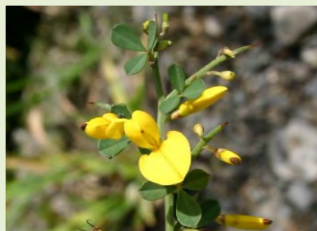
Trevor James, Agresearch

Spiny broom is a many-branched perennial shrub up to 3m tall with spines up to 40mm long, solitary, yellow flowers borne spring-summer and flattened seed pods. It forms dense stands that may reduce the grazing potential of pasture and out-compete tree seedlings in plantation forest. Thickets can shade out native plant species and compete for resources. It is a nitrogen fixer and can increase soil nitrogen to the detriment of low nutrient specialist native species, potentially facilitating other exotic species.