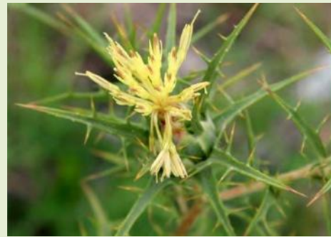
Trevor James, Agresearch

Saffron thistle is a winter annual or biennial herb with glossy spined leaves and yellow flowers bearing a bract of prickles below. It is an unpalatable pasture pest competitive with desirable pasture species. Infestations can impede stock movement and sharp spines cause injuries to the eyes and mouths of grazing animals. It can compete with crops, and impede harvesting equipment with tough stems. It is also likely to be a reservoir of crop viruses and bacteria.