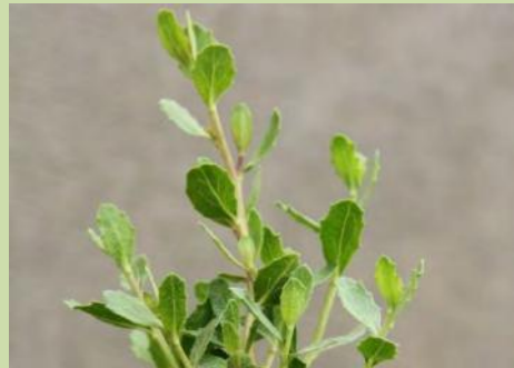
Trevor James, Agresearch

False tamarisk is an evergreen shrub up to 2m tall with small, pink flowers borne in summer. It is capable of colonising riparian margins and braided river beds. It can reduce available habitat for nesting birds in braided riverbeds, while also providing cover for predators.