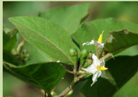
Forest and Kim Starr

Devil's fig is a perennial shrub with white star shaped flowers and yellow stamens. It can grow up to 4m tall in a range of disturbed ecosystems including plantations, pasture and native forest margins. In pasture, it suppresses forage and can create impassable thickets. In native ecosystems, it can provide habitat, fruit and seeds for pest mammals.