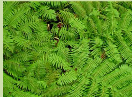
Peter de Lange

Also known as: Australian tree fern Rough tree fern is a sporophyte up to 8-12m tall that predominantly invades disturbed rainforest and forest edges, but has the potential to also invade relatively undisturbed forest and mānuka-kānuka gumlands. It is a highly efficient competitor, displacing co-occurring native ferns in its invasive range overseas. Its strategy of rapid growth and rapid decomposition alters nutrient cycling in its invasive range overseas compared with co-occurring native ferns.