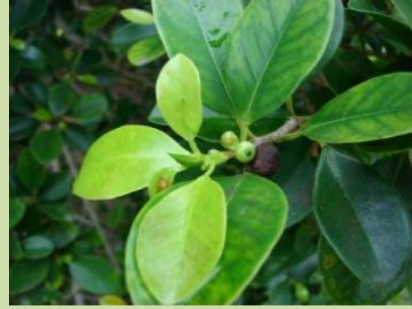
Forest and Bird

Strangling fig is an evergreen tree when mature with thick, leathery leaves and tiny flowers, hidden within the fig-like reddish fruit. The pollinator wasp has recently arrived in Tāmaki Makaurau / Auckland, therefore the reproductive potential is high. It is likely to compete with and strangle native plants, and shade out seedlings and understorey species as it has done overseas. Vegetation communities on volcanic cones, including Rangitoto, could be at risk as other introduced Ficus species have been found in these habitats. Pōhutukawa, mānawa/mangrove and other forest types may also be at risk, particularly in coastal areas. Fruit may facilitate introduced birds and mammals through provision of food source.