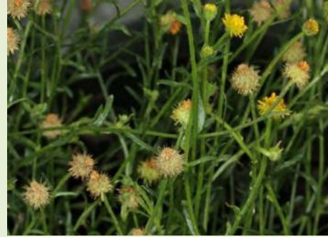
Trevor James, Agresearch

Bur daisy is a small, many-branched perennial herb with small yellow, spherical flowers year-round that dry into tough brown spheres with hooks. It displaces desirable pasture plants, especially on poor pasture, and is a serious contaminant of wool. Similar native plants in dry rocky outcrops or open disturbed ecosystems may be at risk from competition.