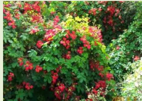
Department of Conservation

Chilean flame creeper is a perennial climber capable of reaching at least 10m into canopy with five-fingered leaves, tubular red/pink flowers borne November-April and blue-black berries. It suppresses native plants via smothering and shading in forest and scrub ecosystems. Bird dispersal has the potential to facilitate spread to inaccessible areas.