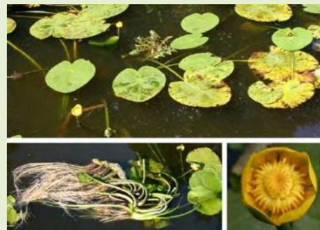
Rohan Wells, NIWA

Yellow water lily is a perennial aquatic plant with both floating oval leaves and submerged very thin leaves. Flowers are yellow and held above the water surface in spring-summer. Dense mats may suppress submerged aquatic plants by shading and can have indirect impacts on plankton by providing refuges from fish predation. Invasion can alter patterns of nutrient storage in sediment and may reduce dissolved oxygen levels in the water column.