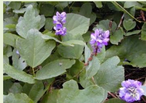
Forest and Kim Starr

Kudzu vine is a herbaceous to semi-woody, scrambling, trailing or climbing vine up to 30m long with large lobed leaves and spikes of reddish-purple, pea-like flowers. It is a very aggressive competitor in native forest, shrubland and riparian margins; altering forest disturbance regimes, out-shading and girdling small trees and chemically inhibiting the growth of co-occurring plants.