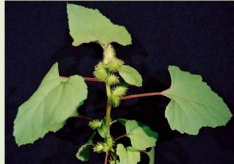
Trevor James, Agresearch

Noogoora bur is an erect, annual herb with blotchy purple stems and small yellow flowers. It is poisonous to livestock and produces hooked burs which cause sores in livestock mouths and hooves. It is a nuisance pest of pasture and crops, especially maize.