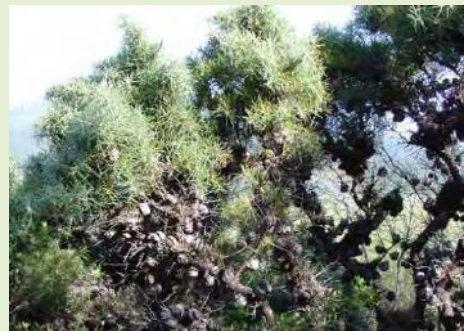
Trevor James, Agresearch

Hakea are large shrubs or small trees with spiny or soft leaves and white and yellow flowers. It is a dominant competitor in open sites with low fertility soil including low forest, scrub, coastal and gumland habitats. It alters moisture regimes, adds to fire risk, alters vegetation succession and contributes to the local extinction of rare native fern, orchid and shrub species.