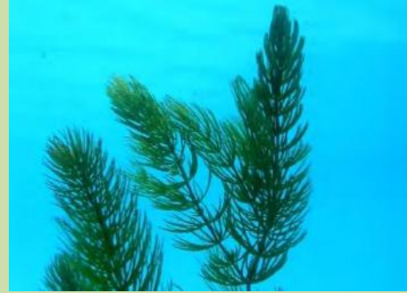
Rohan Wells, NIWA

Hornwort is a perennial submerged aquatic plant up to 7m tall which can be anchored to sediment by stems, or forms free-floating mats. Leaves are 10-40mm long, narrow, branched and whorled forming complex architecture. Hornwort forms dense monospecific stands which can displace all native submerged vegetation down to 15m depth. The dense stands alter water flow, increase flooding risk and impede recreational access of waterbodies. Because it can grow to greater depths than other aquatic weeds, it is the species likely to have greatest impacts on deep-water charophyte meadows. Kōura are also likely to be especially impacted due to requirement for open habitat.