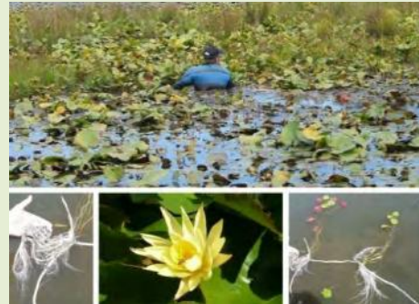
Rohan Wells, NIWA

Mexican water lily is a perennial bottom-rooted aquatic herb with floating heart-shaped leaves and yellow flowers borne above the water surface from October to December. It forms dense mats which can reduce dissolved oxygen levels in the water column by preventing gas exchange between water and air, and may suppress submerged aquatic plants by shading. Impacts on fish, zooplankton and other species resulting from low dissolved oxygen are probable.