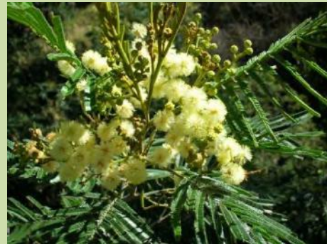
Forest and Bird

Black wattle is a tree best distinguished by its dark green leaves, subdivided into leaflets, and cream flower heads borne in racemes from July-September. It is capable of forming dense stands, competing with other plant species in scrubland, coastal areas and riparian margins. As a nitrogen fixer with rapid decomposition rates, it can modify soil chemistry, moisture content and microbial function in invaded habitats, indirectly impacting vegetation and invertebrate communities.