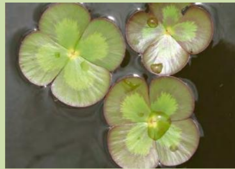
Trevor James, Agresearch

Nardoo is a perennial aquatic fern with clover-like leaves floating flat on the water surface or held up on leaf stalks from damp ground. It reportedly shades out native, bottom-rooted aquatic plants, and competes with small native plants in wetlands and around lake edges. Impacts are likely to be moderately severe based on lifeform.