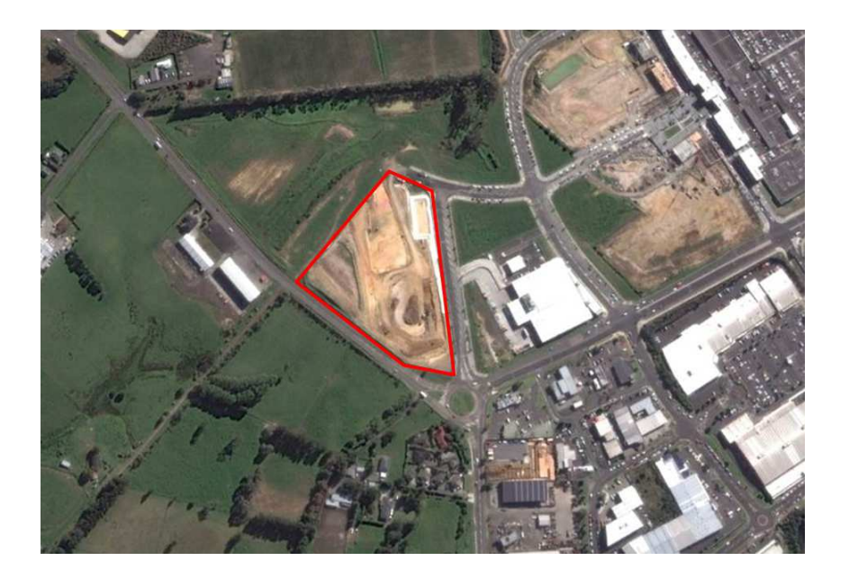
Figure 1: Bunnings store - Locality Plan