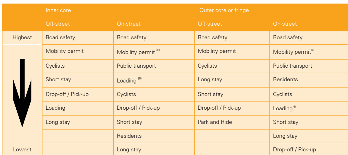
Town centre parking user hierarchy

Due to its economic importance, high priority for the use of available public parking in town centres should be for short stay parking and loading purposes.