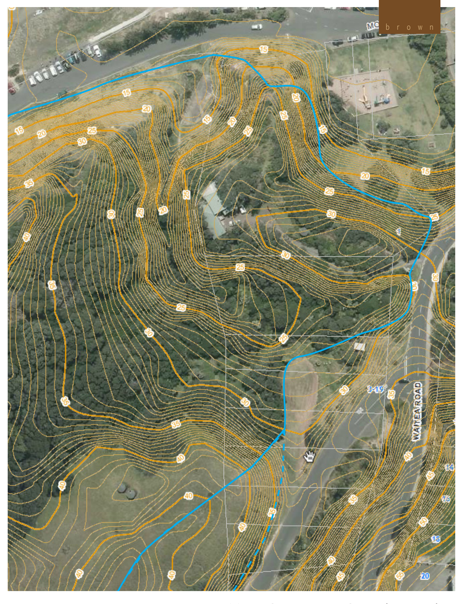
447 MOTUTARA ROAD (PART 1)

Attachment 152_Part13 UNIT 30 (MAP 9) - NC boundary amended to follow edge of coastal slope / bushline - includes building at 1 Waitea Rd.