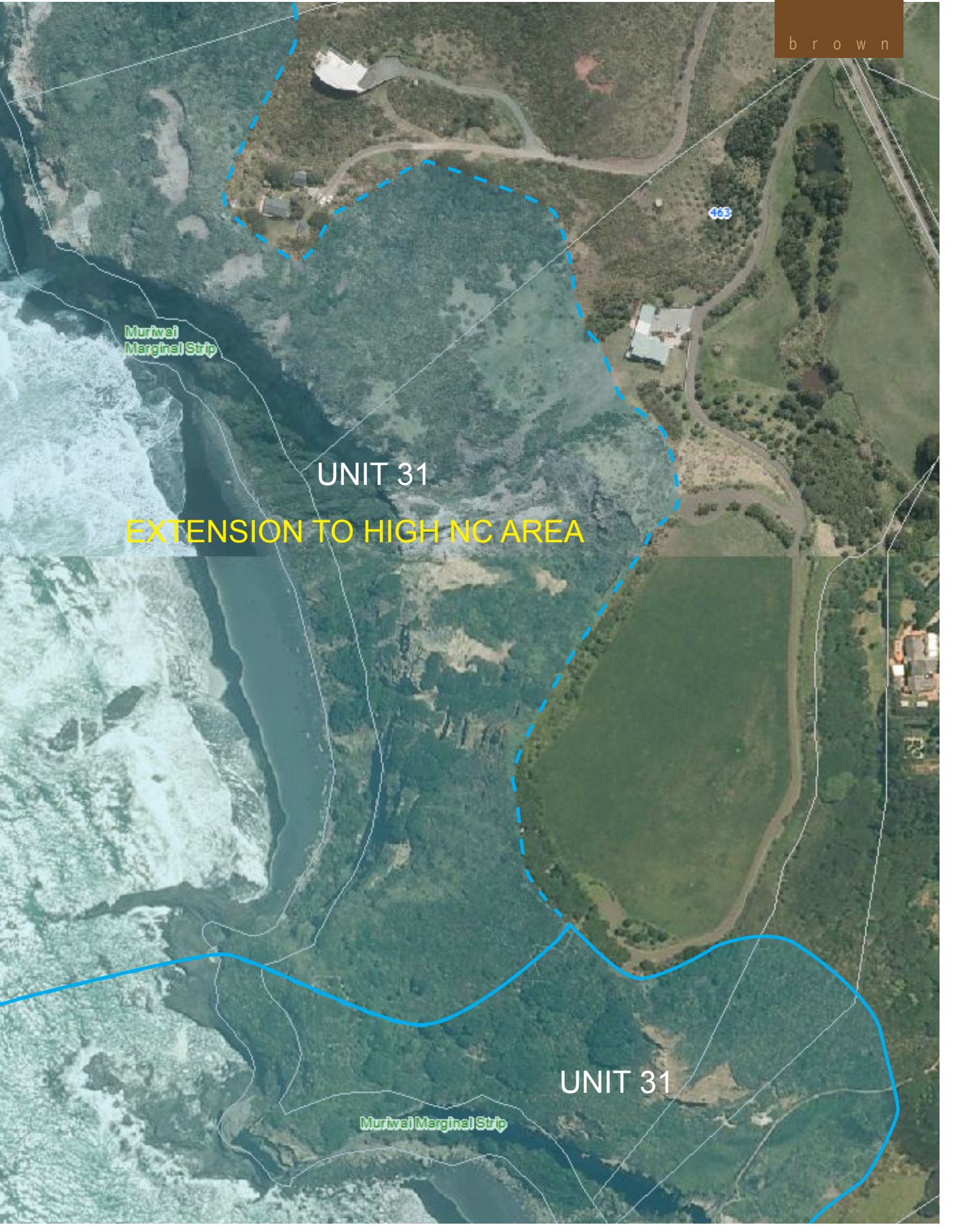
447 MOTUTARA ROAD (PART 3